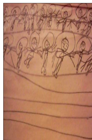
Figure 4: Repeated peculiar characters

The major issue of the present case is comorbidity of TS and ASD because unrecognized autistic spectrum disorder could have an impact on case management and lead to more academic failure and deep social isolation. A comprehensive treatment plan consisting of both biological and psychological aspects is the main point of this case. Family psycho-education, psycho-medications and occupational therapy can be a target of therapeutic interventions and