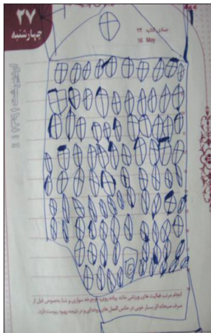
Figure 1: Repeated windows of a house

This paper presents a case of TS with increased writing and painting activities associated with autism, the condition that is uncommon in the practice. It appears that some facets of social cognition, especially