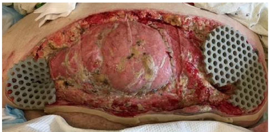
FIGURE 6: POD 15: Application of ROCF-CC with NPWTi-d. Settings at this time were 130 ml of normal saline set to soak