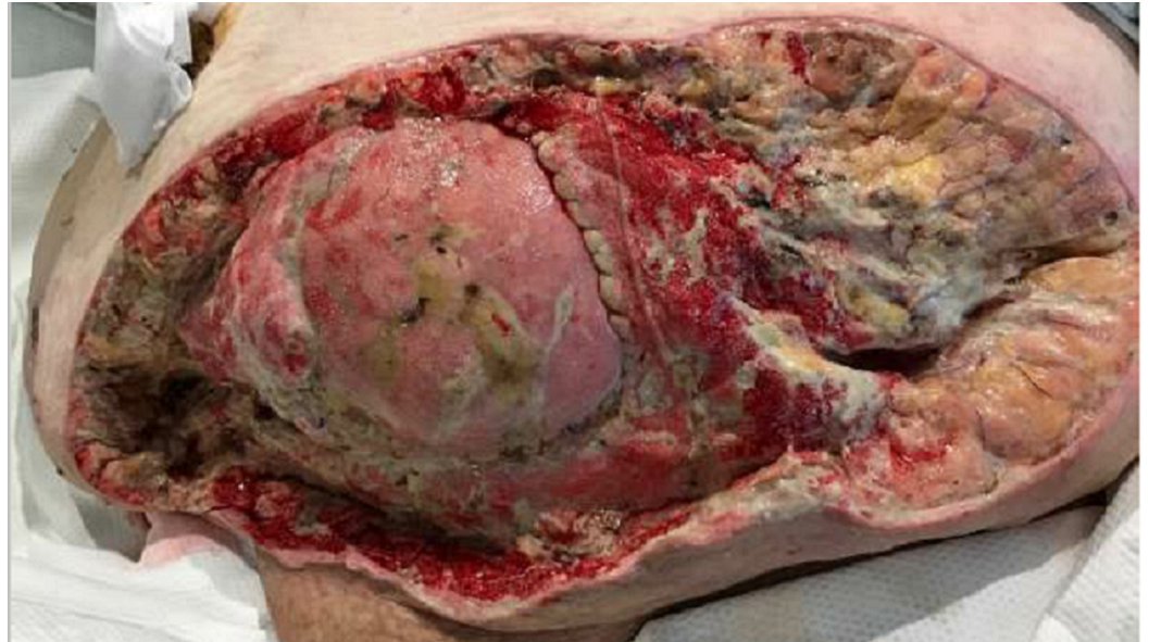
FIGURE 5: POD 15: 40% pink tissue, 20% red tissue, and 40% slough

On POD 15, the first NPWTi-d change was performed at the bedside. The wound base had 40% pink tissue, 20% red tissue, and 40% slough, as seen in Figure 5. White foam was placed over the vicryl mesh. NPWTi-d was placed to the central portion. ROCF-CC was applied to the lateral aspects to assist in the removal of the non-viable tissue, as seen in Figure 6. The goal of therapy was to improve granulation tissue and prevent repeated trips to the operating room.