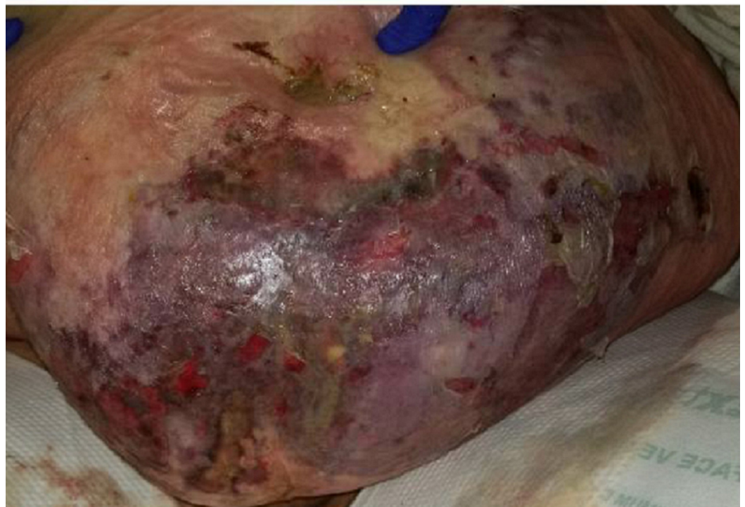
FIGURE 1: Presentation of abdomen

Upon assessment, she had ventral hernias with a leakage of foul-smelling fluid around her colostomy site. She presented with cellulitis of the entire pannus with some superficial epidermal blistering and necrosis, but the subcutaneous tissue appeared viable, as seen in Figure 1. The computed tomography (CT) scan revealed skin thickening and subcutaneous soft tissue stranding consistent with panniculitis/cellulitis with no drainable abscess. She was started on intravenous vancomycin and cefepime for the treatment of the cellulitis.