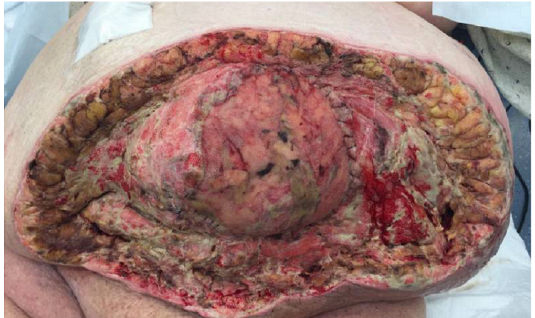
FIGURE 3: POD 9: Measurements 32 x 54 x 5 cm (8,160 cm 3 )

pieces were placed to protect the area with mesh. A total of four kits consisting of both NPWTi-d and ROCF-CC were utilized. The instillation ports were Y connected to the trac pads and applied to four areas in the wound to improve instillation coverage and prevent leakage in the lateral aspects. The NPWTi-d settings were 130 milliliters (ml) of normal saline solution (NSS) to soak for 10 minutes every three and a half hours. Normal saline solution was chosen because it has been shown that despite its direct antimicrobial activity, it can be as effective as other solutions when used with NPWTi-d [6]. The settings for the device were based on the parameters set forth by the review of evidence and recommendations for a cycle frequency of two-four hours at -125 mmHg and a dwell time of 10-20 minutes [7].