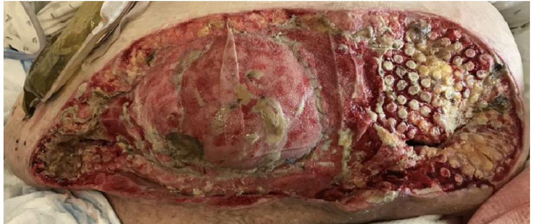
FIGURE 7: POD 22 abdomen: 40% pink granular tissue, 30% red tissue, and 30% yellow slough

The patient underwent four dressing changes at the bedside, utilizing NPWTi-d and ROCF-CC. On POD 22, ROCF-CC was discontinued. There was a decrease in devitalized tissue to the lateral aspects. New granulation tissue was present where the macrocolumns are located as seen in Figure 7. White foam was placed over the area with mesh followed by NPWTi-d.