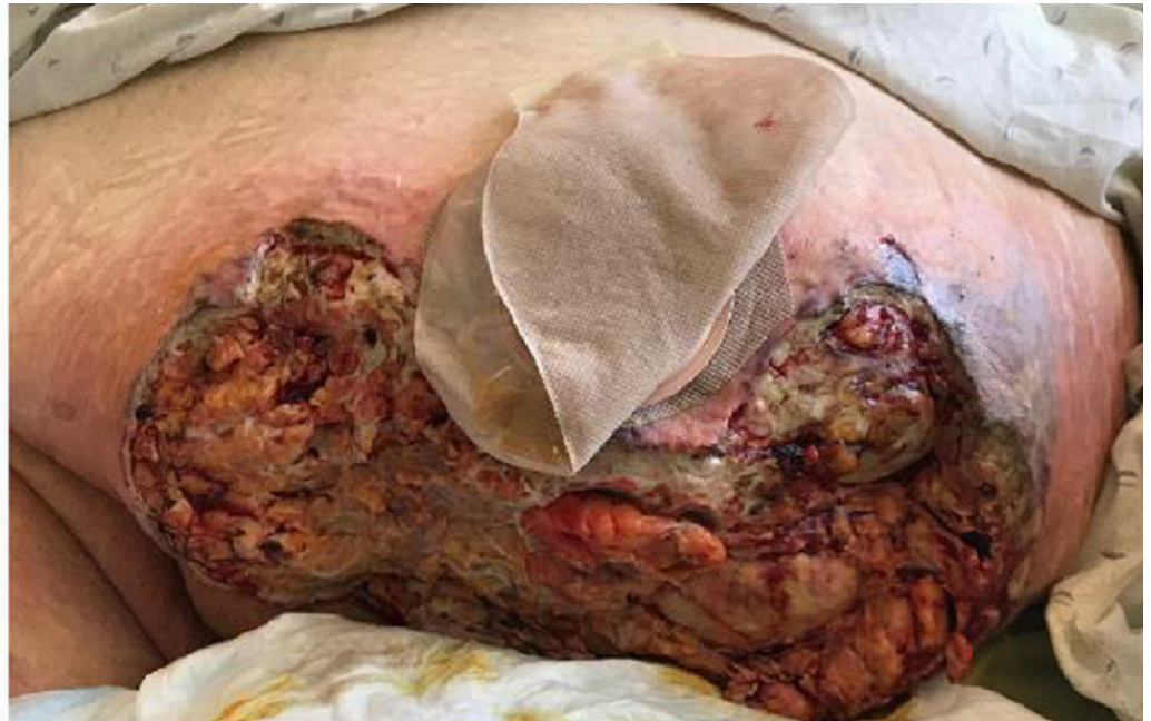
FIGURE 2: POD 1: Exposed bowel noted to mid-section of abdominal wound

On post-op day (POD) one, the dressings were removed by the wound, ostomy, continence, nurse (WOCN) team. Upon removal of the dressings, an exposed bowel was noted (Figure 2). There was necrosis noted to the lateral aspects of the wound. The wound was packed with saline-moistened Kerlix and covered in abdominal pads (ABDs). An ostomy appliance was placed over the fistula. The patient was scheduled for further debridement the next day.