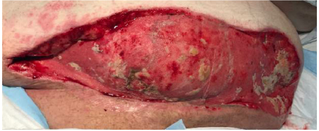
FIGURE 8: DOT 2 of readmission: 85% red tissue, 15% tan slough, measuring 16 x 54 x 3.5 cm (3,024 cubic cm)