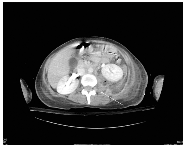
Fig. 5. Abdominal CT scan: extensive retroperitoneal and pararenal abscesses on the left side at the L3–4 level (> 25 cm length) (arrow).

to some simple verbal commands. She showed 4.5/4 mm pupil dilation with no light reflex on hospital day 9. No change in the EVD was detected and an attempt to change the EVD catheter failed due to brain swelling. The CT scan showed increased diffuse brain swelling, so the patient underwent a frontal and parietal bone craniectomy to decrease ICP. She became comatose, and her pupils dilated to 6.6 mm with no light reflex despite the decompressive craniectomy. The EVD catheter failed to drain the CSF and was removed on hospital day 13. Mean systolic blood pressure decreased to 50 mmHg with administration of dopamine. The patient died due to diffuse leptomeningitis on hospital day 19.