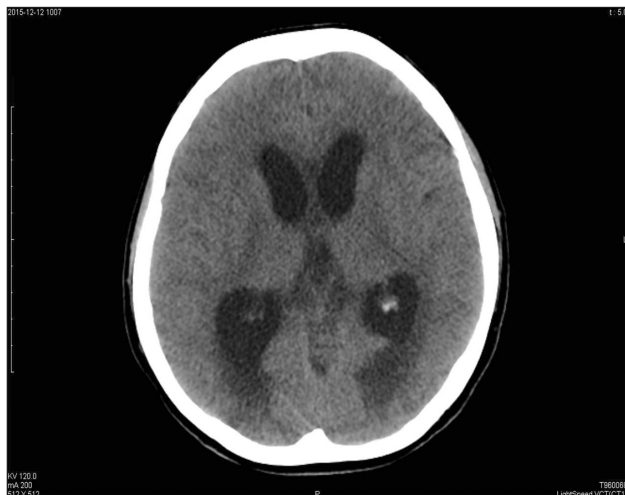
Fig. 4. Brain CT scan: subdural hygroma in the left cerebral space, and hydrocephalus highly suggestive of an infectious condition.