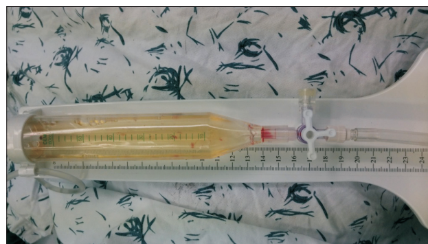
Fig. 3. Yellowish turbid external ventricular drainage (EVD): an EVD tube was applied, which slightly decreased ventricular size.