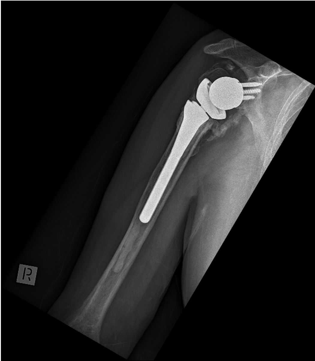
Figure 3 Heterotopic ossification—7 months post surgery.

mediators may be sufficiently stimulated to overcome dormancy. 3,11