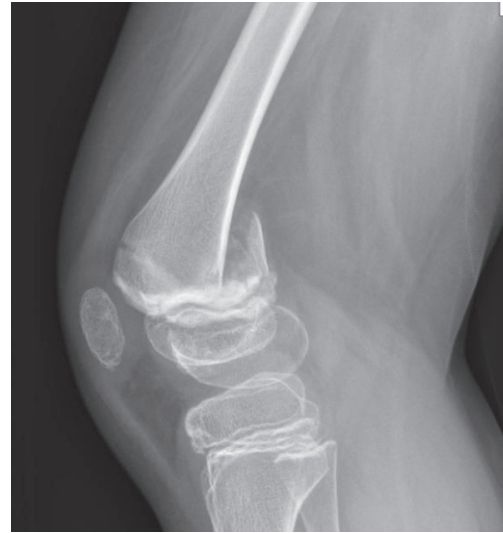
(a) Nondisplaced Salter-Harris type II fracture of the distal left femur