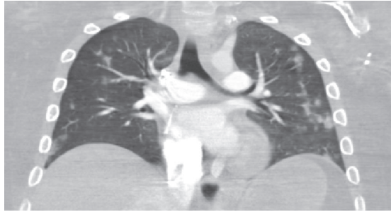
(a) Patchy diffuse nodular airspace opacities seen scattered throughout both lung fields