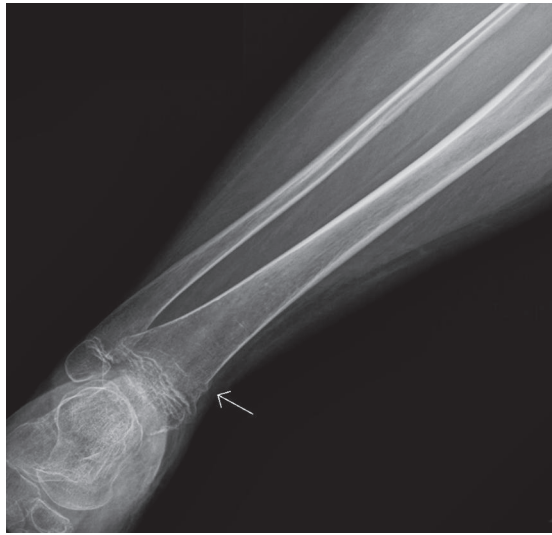
(b) Nondisplaced fracture at the distal right tibial metaphysis and fibular metaphysis