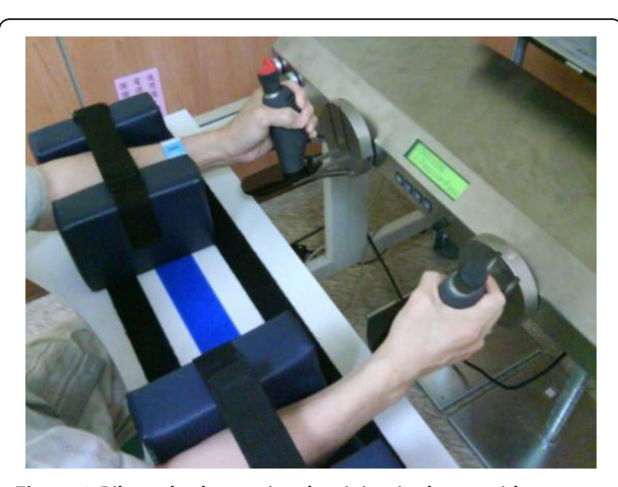
Figure 3 Bilateral robot-assisted training is shown with the Bi-Manu-Track.