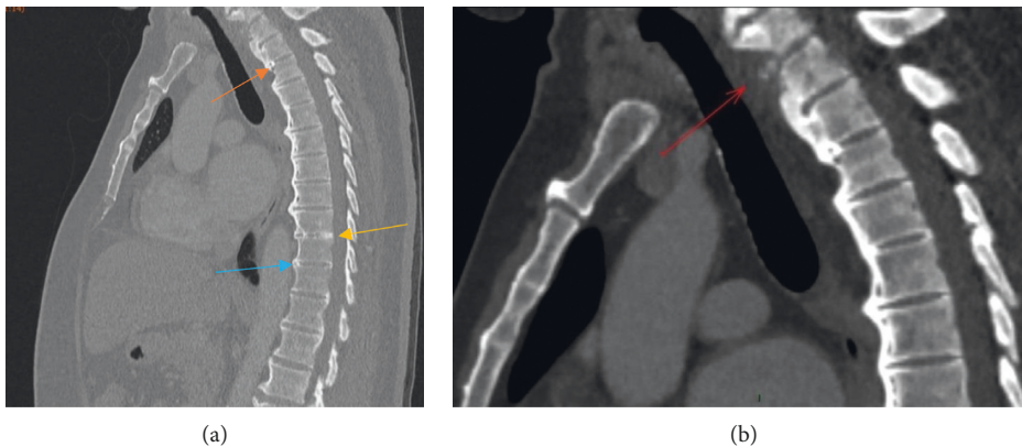
FIGURE 3: CT scan of the cervical and dorsal spine showing erosions on the anterior aspects of the lower vertebral endplate of C7 and the upper vertebral end-plate of T1 with a calcification located in between, at the anterior part of the C7-T1 intervertebral disc ((b) red arrow). (a) Calcifications were also present in the T2-T3 (orange arrow), T9-T10 (yellow arrow), and T10-T11 (blue arrow) intervertebral discs.

these cases, calcification usually involves several levels, including at least the annulus fibrosus. This contrasts with idiopathic CD which only affects the nucleus pulposus and where no underlying systemic condition is usually found [1].