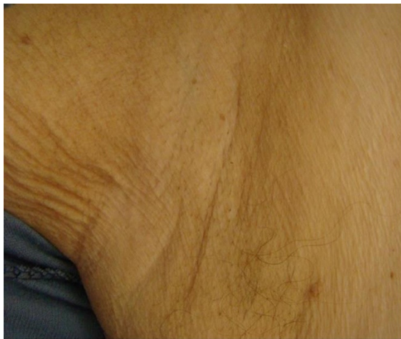
Figure 3 Complete regression of skin condition (right axilla).

serum concentration of testosterone ( <0.03 ng/mL) and increased concentrations of alkaline phosphatase (382 U/L), lactate dehydrogenase (269 U/L) and PSA (1280 ng/mL). Complete blood count revealed slightly decreased white blood cell count ( 4.19 \times 10^3/\mu\text{L} ), hemoglobin 11.5 g/dL, and hematocrit (35.1%). Electrolytes and other biochemical tests were within normal limits. After all clinical data had been collected, the patient was deemed eligible to receive standard cytotoxic treatment and accordingly received eight cycles of prednisone with docetaxel (75 mg/m 2 every 3 weeks) from December 2012 to June 2013. Partial remission of skin lesions was apparent after five cycles of chemotherapy (Figure 2). After completion of the eight cycles, not only had his skin lesions completely regressed (Figure 3), but he also had reduced bone pain, a decrease in PSA serum concentration (162.6 ng/mL), improvement in his general well-being, and slight improvement in his bone metastases according to scintigraphy. In September 2013, recurrence of AN was noted in the form of non-itchy hyperpigmentation of the skin of the abdomen and areolae (Figure 4). There were no dermal lesions in the