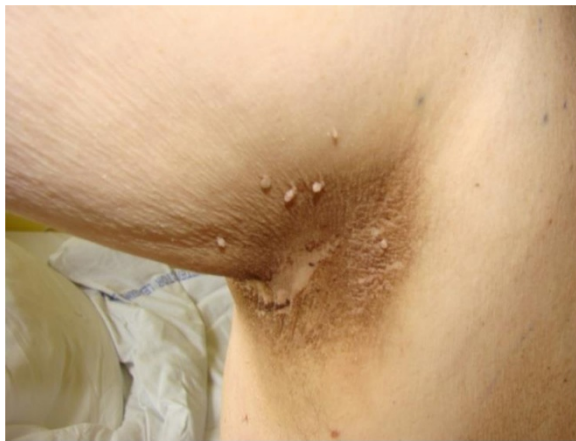
Figure 1 Acanthosis nigricans before starting chemotherapy. Right axilla

[7,8]. The factors responsible for development of skin lesions in patients with benign AN associated with endocrinopathies, obesity or diabetes are hyperinsulinemia and insulin resistance. Excessive proliferation and growth are induced particularly by insulin-like growth factor 1 [9,11].