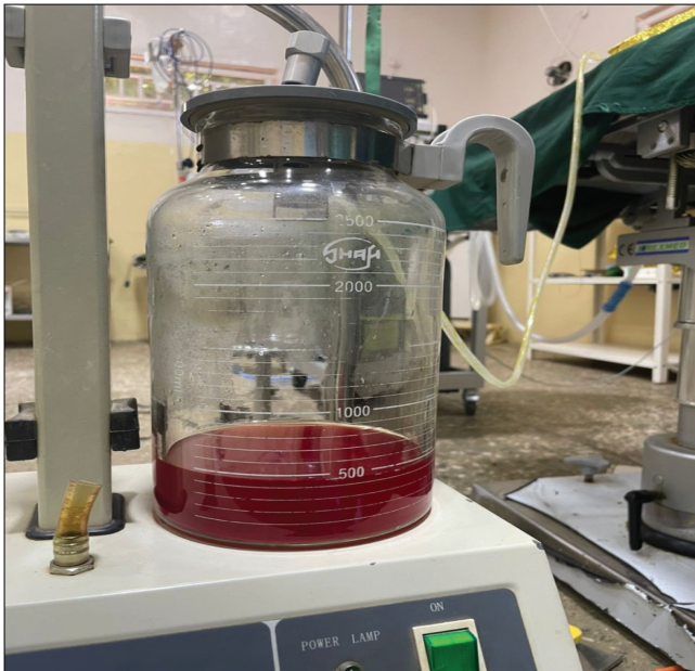
Figure 3: A clinical photograph showing blood and suction fluid (normal saline)