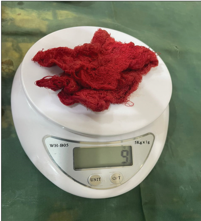
Figure 2: A clinical photograph showing blood-soaked gauze weighing