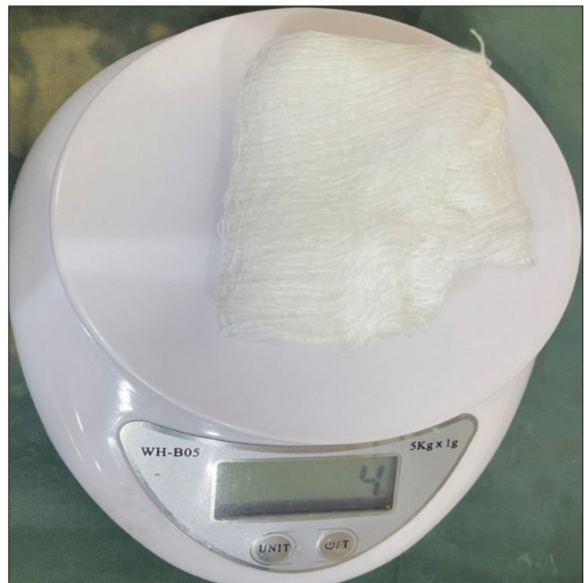
Figure 1: A clinical photograph showing pre-weighing of gauze

Data were entered into Statistical Package for Social Sciences (IBM-SPSS) version 20.0 for analysis. Results were presented in tables and figures and expressed as mean ( \pm SD). Statistical associations were determined using independent and paired t -tests. A p -value of less than 0.05 was considered significant.