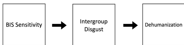
Fig. 1 The Prophylactic Dehumanization Model