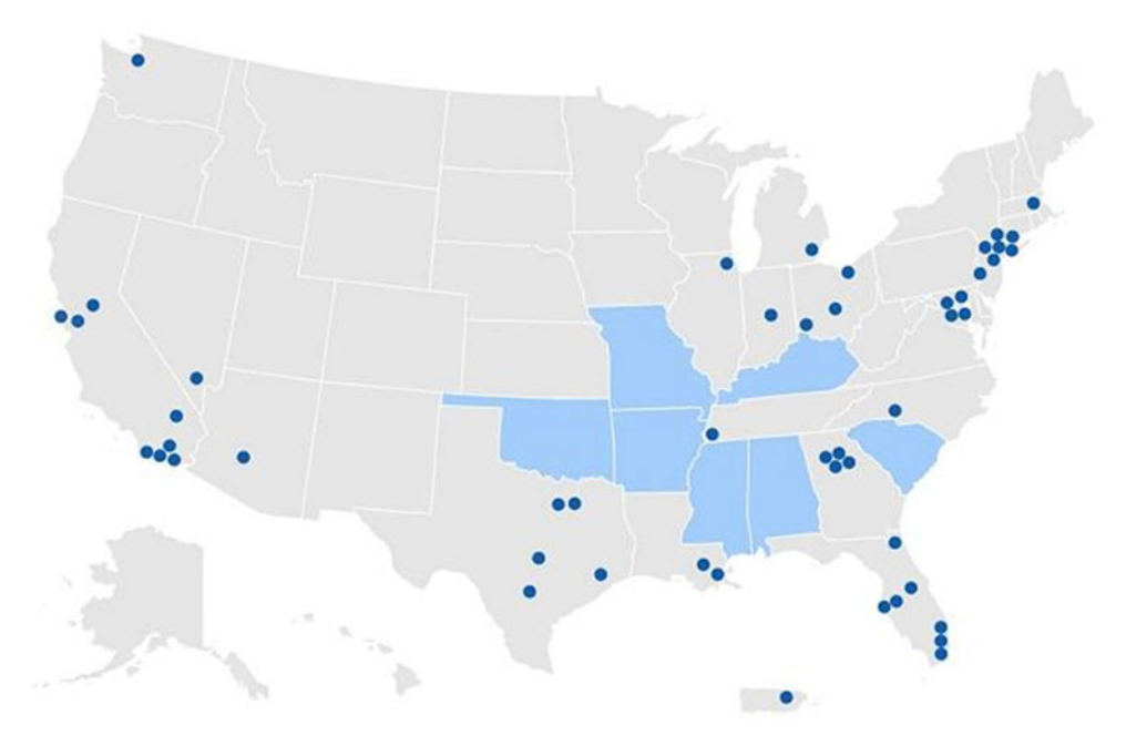
Fig. 1. (a) Location of respondents' primary institutions. (b) US Ending the HIV Epidemic priority states and counties [38].

competent in (82%) addressing diversity, equity, and inclusion in their mentoring. More than 91% report having recommended the program to others, 58% had replicated or were planning to replicate training elements at their home institutions, 74% reported helping others with their mentoring skills, and 50% reported having kept in touch with others from their training workshop cohort.