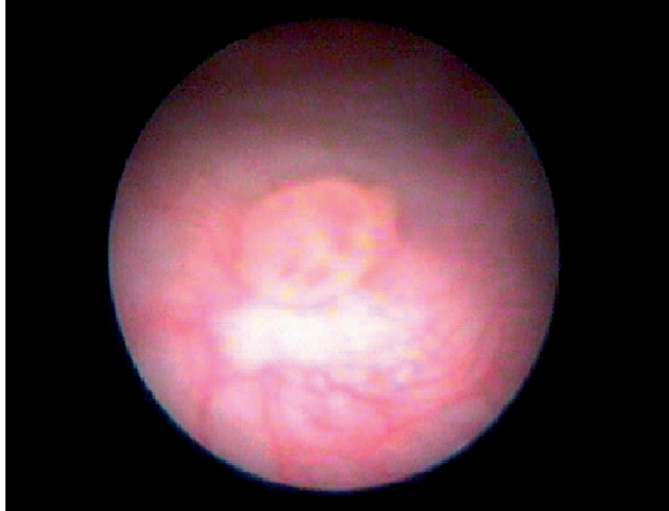
Figure 2 - Cystoscopic view of a papillary bladder tumor (AP: low grade Ta).