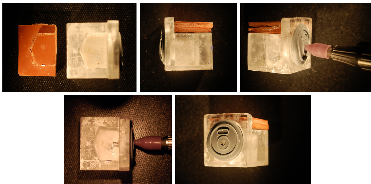
Figure 1 Aerial view of the groover with lid removed (upper left), front view of the groover (middle left), side view of the groover with the handpiece in (upper right), aerial view of the groover with the handpiece in (lower left), and side view of the groover (lower right). The interior of the chamber measures 16 mm in width, 16 mm in length (from the front to the pentagon's point, which is the back of the chamber), and 16 mm tall.

Efficiency was defined as the number of seconds that ultrasound was used for lens fragment removal. Efficiency