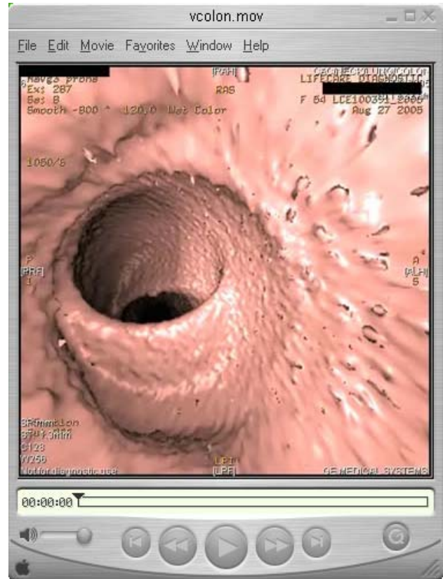
Figure 2 An example of a QuickTime movie showing a virtual colonoscopy.