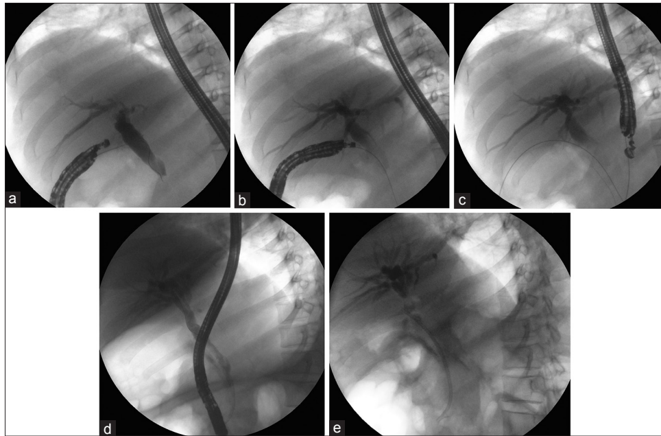
Figure 3. EUS rendezvous. (a) The biliary tree is punctured from the second part of the duodenum, and a guidewire is passed toward the duodenum through the papilla. (b) The wire is successfully passed through the papilla into the duodenum. (c) The echoendoscope is withdrawn while the wire is kept in place. (d) The stent is inserted into the biliary system through an ERCP in a retrograde fashion. (e) The final image depicting the stent in place

stent is used or a self-expandable metal stent as well as double-pigtail stents and/or a nasobiliary tube is inserted into the gallbladder.