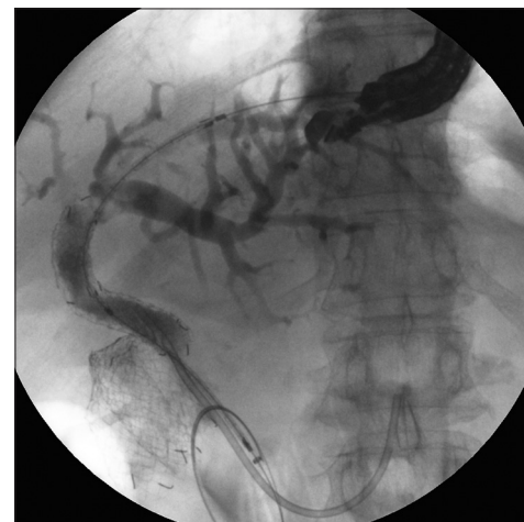
Figure 4. EUS-guided antegrade transpapillary drainage in a patient with a blocked biliary metal stent and a migrated plastic biliary stent that was inserted after that and who has a duodenal metal stent for gastric outlet obstruction

In this case, a stent is inserted through the gastrointestinal wall and traversing the location of