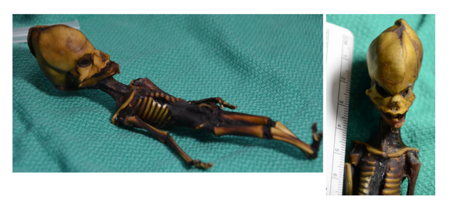
Figure 1. Mummified specimen from the Atacama region of Chile. Representative photograph of the 6-in skeleton (left) and frontal view of the skull of the Ata specimen (right).

genetic ancestry and sex determination, identification of diseaseand phenotype-associated genes, and novel single nucleotide variation (SNV) detection.