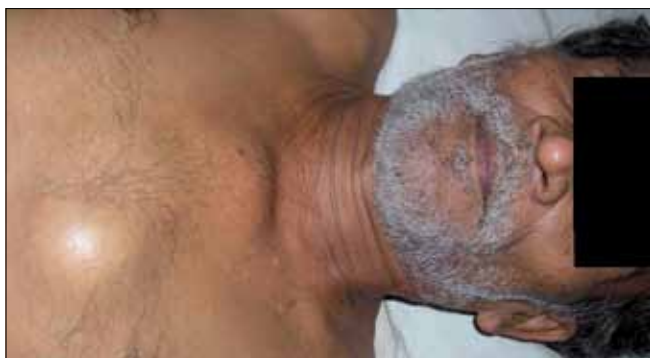
Figure 1: Multiple cystic swelling on the anterior chest wall