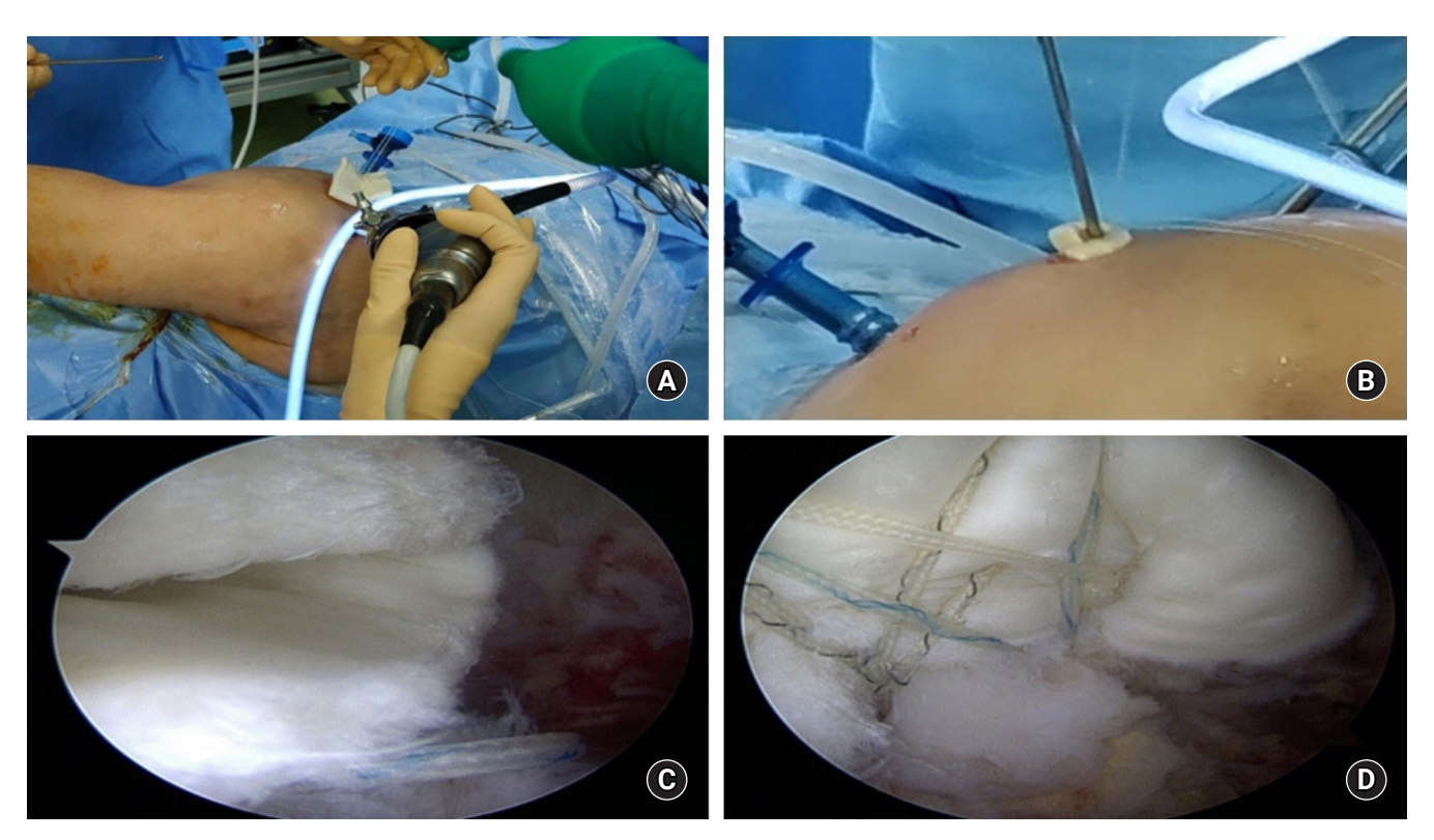
Fig. 3. (A, B) Photographs representing the procedure of arthroscopic allograft dermal patch augmentation. (C) Arthroscopic view entering allograft dermal patch. (D) Arthroscopic view after repair with patch augmentation.

A cadaver study reported the upward stability of the glenohumeral joint provided by superior capsular reconstruction [68]. In this study, the authors contended that superior capsular recon-