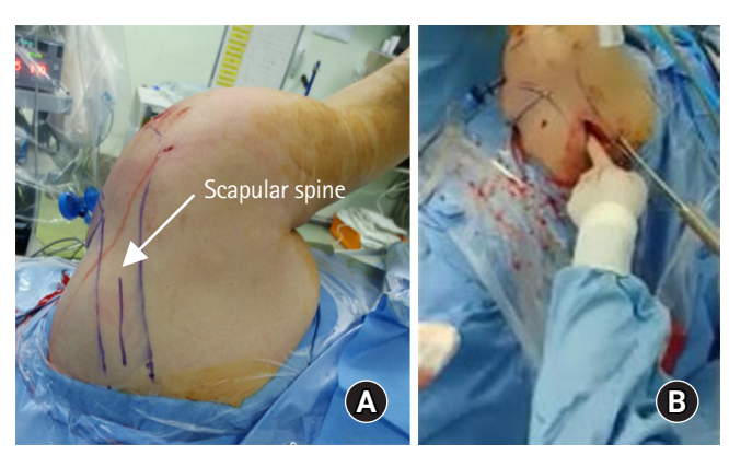
Fig. 1. (A) Surface anatomy for advancement. The part drawn in blue is the scapular spine. (B) Intraoperative procedure of advancement. About 5-cm incision to detach trapezius and to elevate supraspinatus and infraspinatus from its fossa.

Recently, Yokoya et al. [49] published a comparative study of the muscle advancement technique. In this study, the authors per-