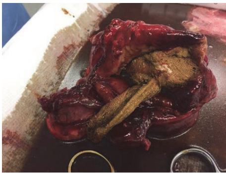
FIGURE 4: Postoperative photo of dissected gossypiboma specimen showing the retained laparotomy sponge from our patient's previous operation.

removed and she is discharged on a home insulin regimen. She is encouraged to follow up with her rheumatologist regarding restarting her rheumatoid arthritis therapy.