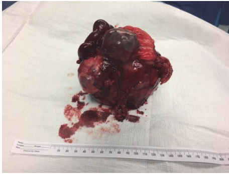
FIGURE 3: Postoperative photo of intact gossypiboma specimen with attached right ovary and portion of small bowel.