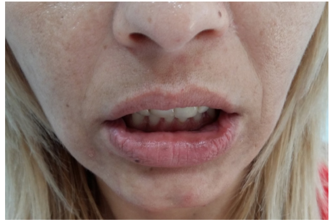
Figure 2 Darkened lesions in the inner aspect of the lower lip.