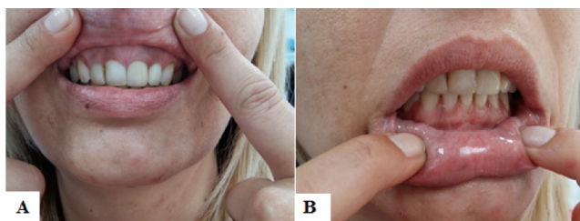
Figure 1 (A) Hyperpigmented brownish areas on the anterior gingiva of the upper jaw. (B) Longitudinal hyperpigmentation on the anterior gingiva of the lower jaw.

During a routine dental check-up, a 38-year-old Caucasian woman was noted to have hyperpigmented areas on the anterior gingiva (Fig. 1). She reported having these changes for the last 4 years without any symptoms. She had recently noticed hyperpigmented stripes on her nails. Dermatologist referred her to see an endocrinologist in order to exclude Addison's disease. The general physical examination was normal. She appeared to be a healthy looking young woman. During the full body skin examination, she was found to have distinct darkened lesions in the inner aspect of the lower lip along with longitudinal hyperpigmented lines of the first left fingernail and the fourth right toenail (Figs 2 and 3). The alteration on her nails appeared to have recently and gradually lost the intensity. Besides, our patient had always been healthy and had not been taking any medication. There were no clinical signs suggestive of endocrine dysfunction. Her menarche occurred at 14 years of age, and her menstrual cycles had been regular. She denied a history of trauma, bone fractures, sexually transmitted diseases or exposures to heavy metals. However, she was a smoker. Her family history was notable for leukemia and breast cancer in her maternal aunt and pancreatic adenocarcinoma in her paternal aunt. There was no knowledge of intestinal polyposis or stomach, intestine or colon cancer in her family.