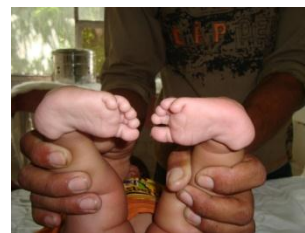
Photographs at presentation