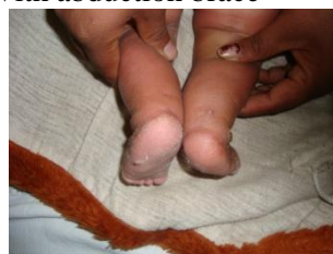
Follow up at 6 months of age