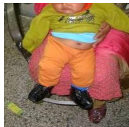
With abduction brace