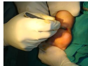
Tenotomy after 3 rd cast