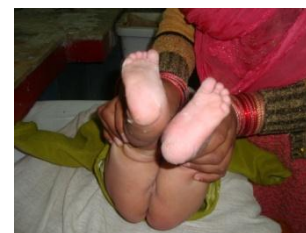
Figure 4. Serial photographs of a two Months old female child with Bilateral Clubfeet

In the study while evaluating the pre and post Pirani scores (Table 2) and the goniometric measurements by the Wilcoxon Signed Rank