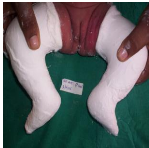
4 th (final) cast