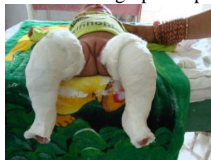
After 2 nd cast