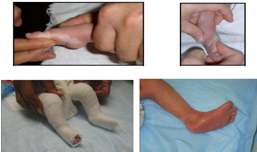
Figure 1: The First cast: Correction of cavus deformity

In doing so, the cavus (Figure 1) is corrected, typically after one cast.