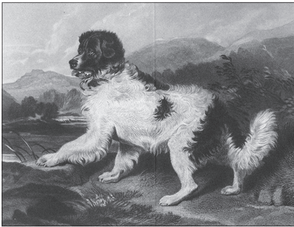
Fig. 2. A print of Landseer's painting of the Newfoundland dog Lion.

resulting from genotyping or genomic sequencing, but rather interpretations of breeding results.