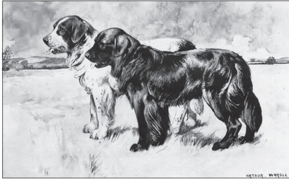
Fig. 1. A solid black Newfoundland and a Landseer, from Rawdon Lee's History and Description of the Modern Dogs of Great Britain and Ireland .