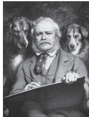
Fig. 4. An 1865 print of Landseer’s ‘The Connoisseurs’: a self-portrait with two of his dogs.

The best way of studying dog colour genetics is by way of recording breeding histories, but prior to the late Victorian dog fancy, there was very little interest in recording the breeding of dogs. Thus the historical