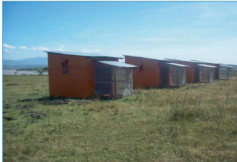
Figure 1 Experimental huts used for the study.

with a flat fan nozzle [29]. The untreated bed net is made of white 100-denier polyester multifilament net (Siamdutch Mosquito Netting Co., Ltd, Bangkok, Thailand). Six holes of 4 cm × 4 cm were made in each mosquito net, two in each long side and one at each shorter side to simulate the conditions of a torn net and to ensure that the insecticide, rather than the net, effectively prevents mosquito bites. Huts assigned for IRS treatment were fixed throughout the study according to the WHO guideline, as the IRS treatment could not be rotated due to residual effects of DDT [30]. The LLIN, untreated net and unsprayed hut treatments, however, were rotated weekly between huts, in a 3x3 Latin square design (LSD), with week and hut being the rows and the columns of the Latin square.