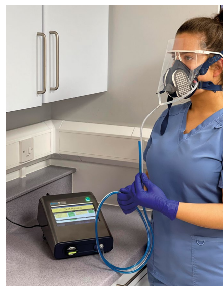
Fig. 10 A quantitative fit test being performed