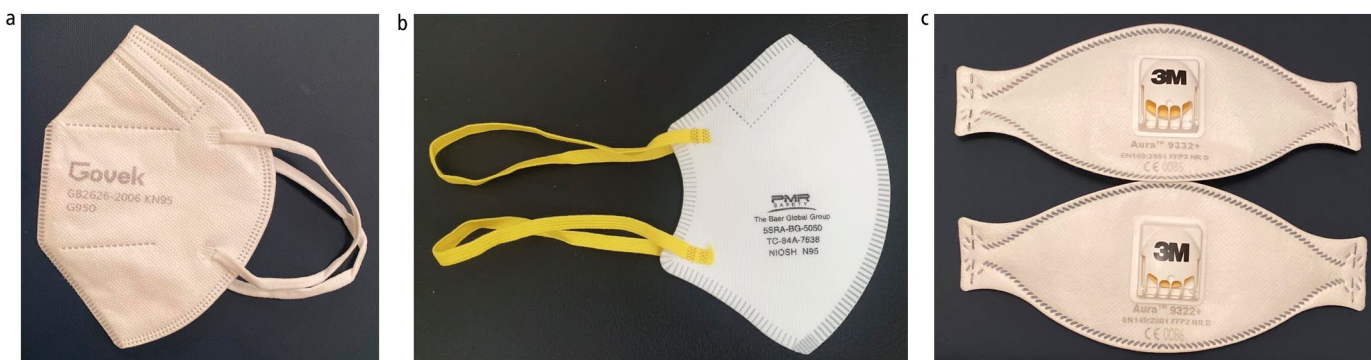
Fig. 2 a) A KN95 respirator; b) An N95 respirator; c) FFP3 (top) and FFP2 (bottom) respirators