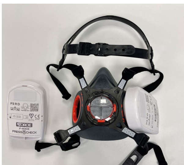
Fig. 6 Reusable respirator with a detachable filter