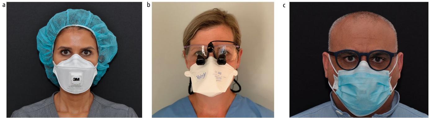
Fig. 3 Clinicians wearing: a) a disposable valved filtering facepiece (FFP); b) a disposable valveless FFP; c) a surgical mask over a valved FFP3 respirator