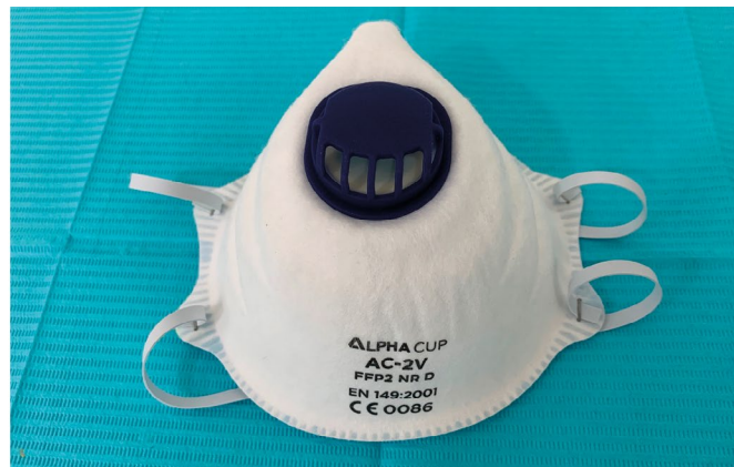
Fig. 4 Markings on a genuine filtering facepiece

When considering filtering capacity alone, KN95, N95 and FFP2 respirators are considered equivalent, and KN99, N99 and FFP3 respirators are also considered equivalent. KN95 respirators have been deemed by the Health and Safety Executive (HSE) as unsuitable for use in the UK; 14 however, if an N95 mask undergoes further assessment by UK/European standards, its ability to seal the face can be determined. If a mask classified according to its filtering capacity alone is further tested for its face-fitting standard and passes, it would then be reclassified. An N95 mask would be reclassified as an FFP2 respirator and an N99 mask would be reclassified as an FFP3 respirator. It is for