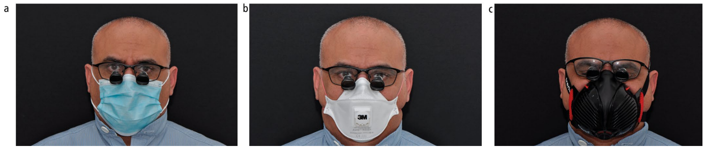
Fig. 7 a, b, c) A respirator may prevent the eyewear sitting on the bridge of the nose

under local anaesthesia to conscious patients, communication with empathy is vital. 19 Changes in practice will inevitably be required as well as changes in patient expectations.