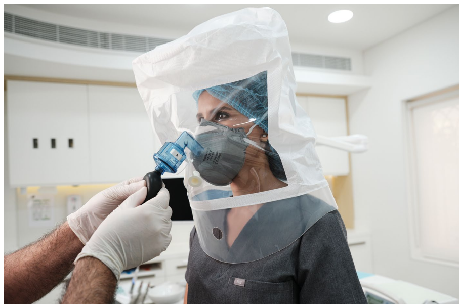
Fig. 9 A qualitative fit-test being performed