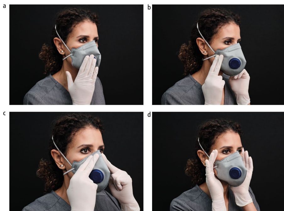
Fig. 11 A fit check to ensure there are no leakages when first donning the respirator

that there is a leakage, suggesting the airborne hazard can pass through to the oral cavity. The fit-test would illustrate this to the wearer and can be utilised as a learning opportunity to help ensure a depth of understanding in respiratory protection concepts, in the hope of stronger compliance in use as instructed