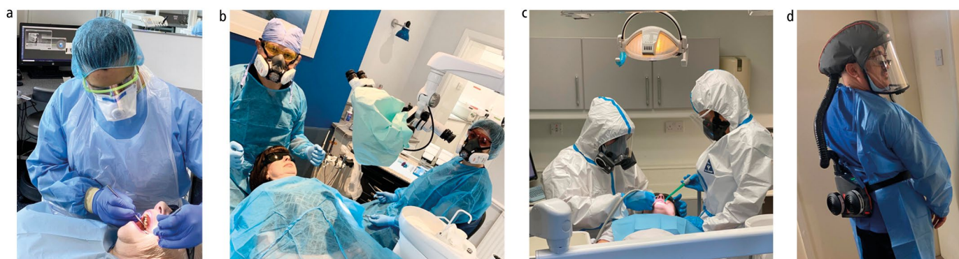
Fig. 1 A dentist wearing: a) a disposable filtering facepiece respirator; b) a reusable half-mask respirator with a particle filter; c) a full-face tight-fitting facepiece; d) a powered air-purifying respirator (PAPR) with a head-mounted loose-fitting full-face visor

Respirators that are classified in China or the US are assessed according to their filtering capacity. KN95 or KN99 respirators are Chinese in origin (Fig. 2a) and N95 or N99 respirators have been classified in the US (Fig. 2b). They are essentially identical. A KN95/N95 respirator carries a filtering capacity of approximately 95% and a KN99/N99 respirator carries a filtering capacity of approximately 99%. 12,13 No respirator offers a 100% filtering capacity.