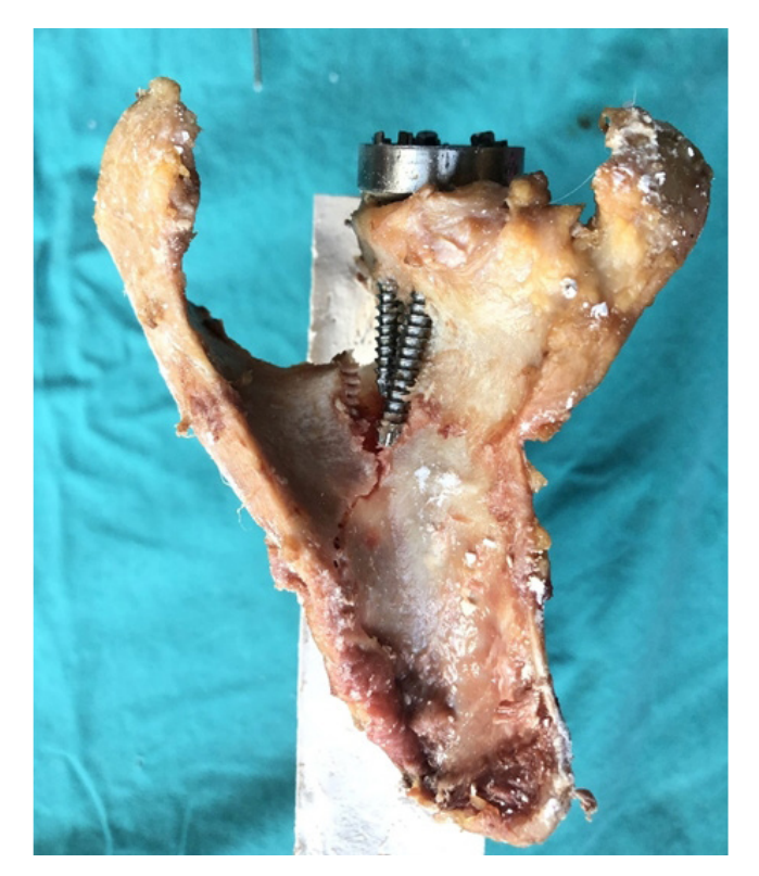
Fig. 3. Two long outside-in screws associated with acromion spine base fracture.

The main finding of the study was that when the superior metaglene screw (with or without a posterior or anterior screw) enters into the base of the spine with an outside-in configuration, it