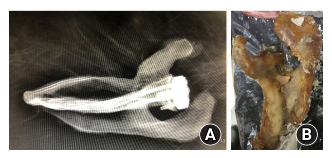
Fig. 2. (A) Long superior and long anterior outside-in posterior screws. (B) Acromion spine base fracture.

Data analysis was performed using IBM SPSS ver. 20.0 (IBM SPSS Corp., Armonk, IL, USA). The Mann-Whitney U-test was used to analyze the difference between the mean values of tested variables among the groups. First, the spine fixation group (n=7)