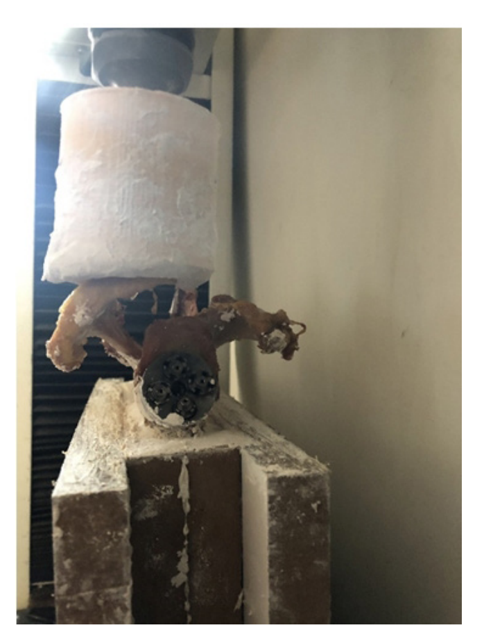
Fig. 1. Test set up.