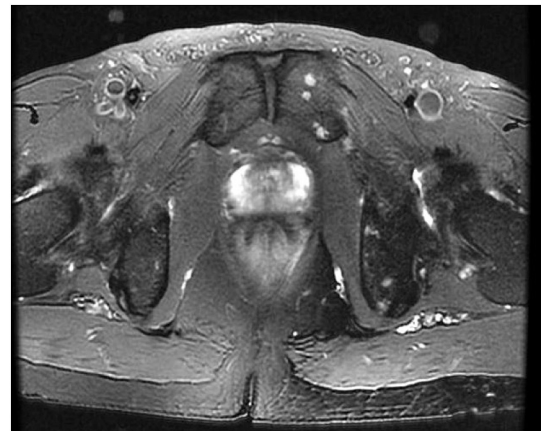
Fig. 3. Prostate MRI showing abnormal signals in the bilateral and peripheral lobes of the prostate, suggesting a possibility of prostate cancer.

orally), and zoledronic acid (4 mg/time, once every four weeks, intravenous infusion). The patient's condition continued to deteriorate, and he died 12 months after the initial presentation. An autopsy was not obtained.