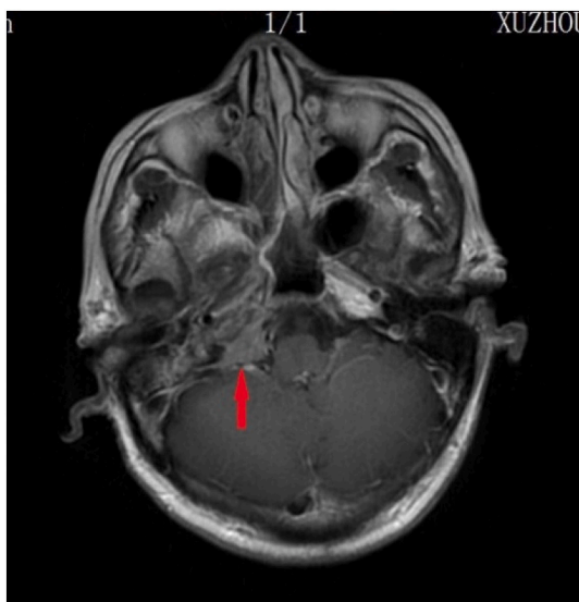
Fig. 1. Brain MRI demonstrating an enhanced mass lesion in the right cerebellopontine angle.