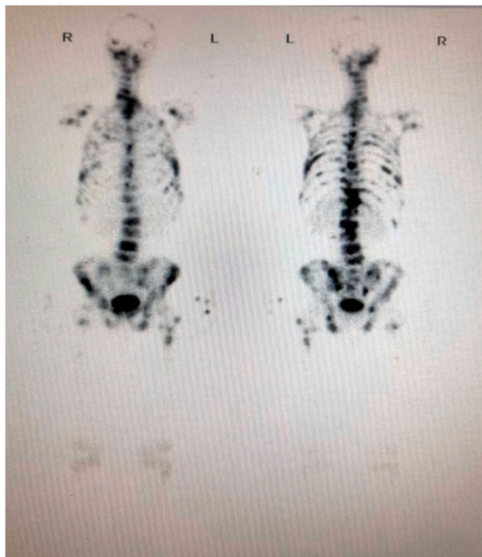
Fig. 4. Widespread bone metastases were detected by ECT.

only 0.2 % to 2 % of all brain metastases [1,4]. Intracranial metastasis as the first clinical symptom of prostate cancer is extremely rare. To our knowledge, this is the first report of a misdiagnosis of acoustic neuroma followed by confirmation of prostate cancer metastasis. The rarity of such reports may be related to the reason for the rare infratentorial metastasis of prostate cancer. A retrospective study of 31 prostate cancer patients with intracranial metastases from Stanford Medical Center found that 61 % had supratentorial metastases and only 10 % had infratentorial metastases [1]. Cranial nerve injury due to intracranial metastasis of prostate cancer is uncommon, but its clinical manifestations are significant. There are a number of reports about the symptoms of cranial nerve dysfunction caused by brain metastases of prostate cancer. The cranial nerves involved include II nd , III rd , IV th , V th , VI th , VII th , and XII th [5], but there is no report of the VIII th cranial nerve injury. In our article, we report the VIII th and VII th cranial nerves palsy for the first time, caused by brain metastases from prostate cancer, with symptoms similar to an acoustic neuroma.