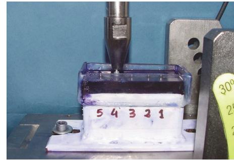
FIGURE 1: Working model. Cyclic compressive load test.

A large number of literature references compare the retentiveness of these cement types in implant dentistry with different types of prosthetic restorations and abutments, different conditions of compressive loading, and different simulating intraoral conditions [6, 9–11, 17–29]. By contrast, there are very few references comparing retentiveness before and after a cyclic compressive loading which simulates mastication to decide whether the final retention of these cement types after a long period of mastication is enough to support the retrievability and at the same time keep the restoration in place [8, 18, 20, 26]. Knowledge of these data may be useful to clinicians to decide which cement to use if they need to retrieve the restoration. The aim of this study was to assess and compare retention before and after a cyclic compressive loading of five commonly used dental cement types when cementing cast crowns to implant abutments in relation to the retrievability of the restoration. The null hypotheses were that retention loss after the cyclic compressive loading of the cement types with higher tensile bond strength (resin composite and resin-modified glass ionomer) would be similar to cement types with lower tensile bond strength, such as glass ionomer, compomer, and urethane-based resin, and five cement types would allow the retrievability of implant-supported cemented prostheses.