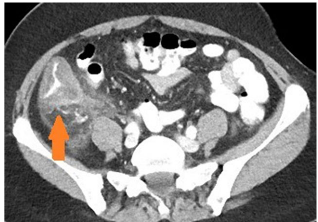
Figure 4: Axial view of patient with appendicitis. Eccentric caecal wall thickening (maximal surrounding the appendiceal orifice) with layered mural contrast enhancement secondary to prominent submucosal oedema (arrow) and prominent pericolic fat stranding represent the CT manifestation of the surgical phlegmon.

intravenous antibiotics, and was well at her 2 week post-operative review. Histopathology confirmed acute appendicitis with transmural inflammation extending into the mesoappendix and no evidence of malignancy.