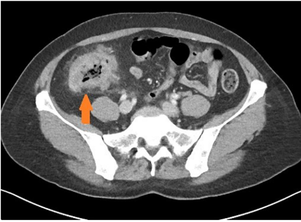
Figure 1: Axial view of patient with caecal carcinoma. Eccentric caecal wall thickening with homogenous contrast enhancement (arrow). Mild pericolic fat stranding is present.