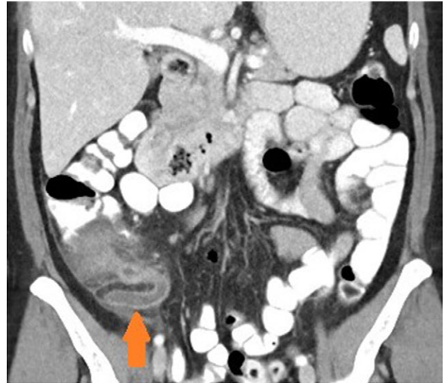
Figure 3: Coronal view of patient with appendicitis. Dilated and thick walled appendix (arrow).

The second patient had a laparoscopy, and appendicitis with serosal inflammatory changes of the caecum was noted. Due to a fragile appendiceal base, a laparoscopic ileo-colic resection was completed. She required a 5-day stay in hospital with