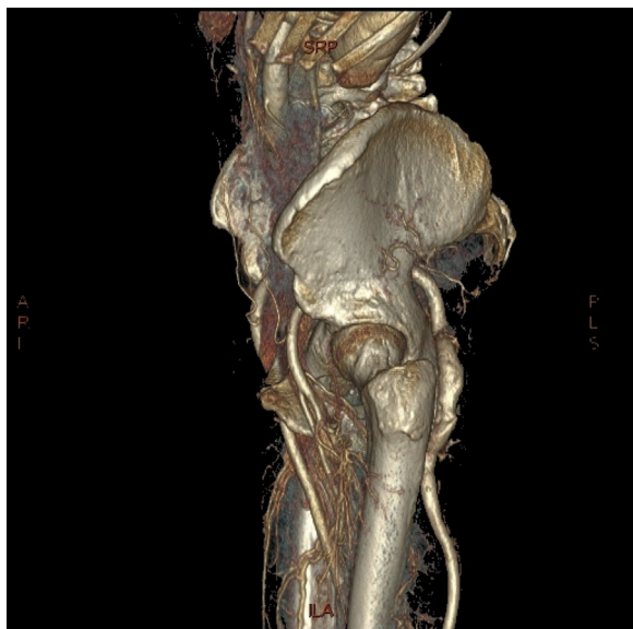
Fig 1. Preoperative lateral computed tomography angiography reconstructed three-dimensional view of the perfused sciatic artery aneurysm of the left side. In the foreground, anterior, note the left femoral artery bifurcation with its outgoing hypoplastic superficial femoral artery in comparison to the normal-caliber contralateral one in the background.