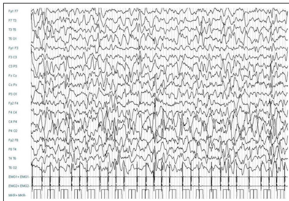
Figure 3. Disappearance of burst suppression pattern after the vagal nerve stimulation implant.