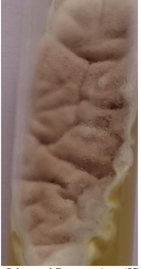
Figure 3. Culture on Sabouraud Dextrose Agar (SDA) showing flat and velvety lilac colour colonies

unbranched chains, and phenotypically identified as Purpureocillium lilacinum (Figure 4).