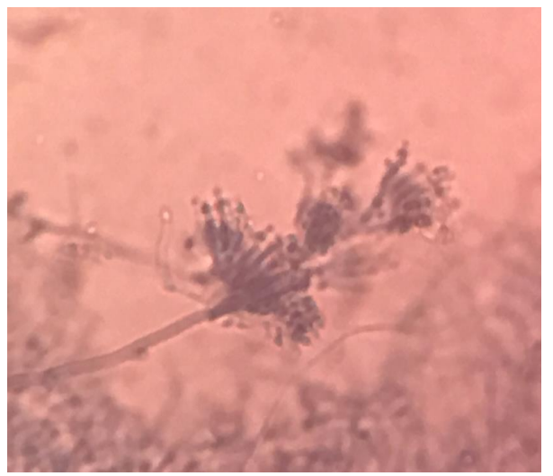
Figure 4. Lactophenol cotton blue showing thin hyaline septate hyphae with irregularly branching conidiophores, elongated phialides, which have a tapering end and are densely clustered (400X magnification)

The patient was started on antifungal tablet itraconazole 300 mg once daily. The swellings were surgically excised and histopathological examination of the excised tissue revealed thin septate hyaline hyphae. After three months of itraconazole therapy, the patient had no new swellings but complained of a