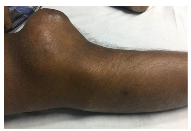
Figure 1. Clinical image of the patient showing knee swelling

multiple painless swellings in the right leg region for the preceding one month; the biggest swelling measured 10 \times 7 cm near the knee region (Figure 1) and multiple small swellings were noticed between the knee and ankle. There was no history of previous similar swellings. His random blood sugar at the time of admission was 345 mg/dl and HbA1c 10.7%. Insulin dose was adjusted and it reduced to 135 mg/ml on the fifth day of admission.