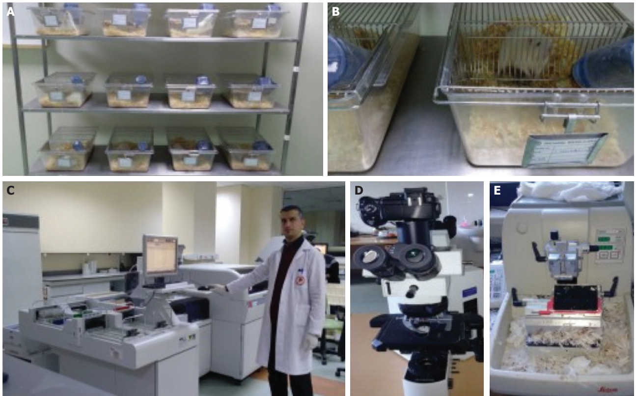
FIGURE 1. Animal experiment, total antioxidant status, total oxidant status, and pathological analyses. (A) Housing of the experimental animals. (B) Each rat was kept individually in a standard cage. (C) The auto-analyzer used for oxidant-antioxidant analyses (AU5800; Beckman Coulter, Inc., Brea, CA, USA) and researcher. (D) The optical microscope and integrated camera system used in the histopathological analysis (BX51; Olympus Corp., Tokyo, Japan). (E) The microtome device used in the histopathological analysis (RM 2245; Leica Biosystems Nussloch GmbH, Wetzlar, Germany).

OSI = TOS/TAS . The principle of TAS measurement is that antioxidants in the sample reduce the dark blue-green colored 2,2'-Azino-bis (3-ethylbenzthiazoline-6-sulfonic acid) (ABTS) radical to a colorless, reduced form of ABTS. The change of absorbance at 660 nm is related to the total antioxidant level of the sample. The assay is calibrated with a stable antioxidant standard solution known as Trolox Equivalent, which is similar to vitamin E [29]. The principle of TOS measurement is that oxidants present in the sample oxidize the ferrous ion-chelator complex into ferric ion. The oxidation reaction is prolonged by enhancer molecules, which are abundantly present in the reaction medium. The ferric ion provides a colored complex with chromogen in an acidic medium. The color intensity, which can be measured spectrophotometrically, is related to the total amount of oxidant molecules present in