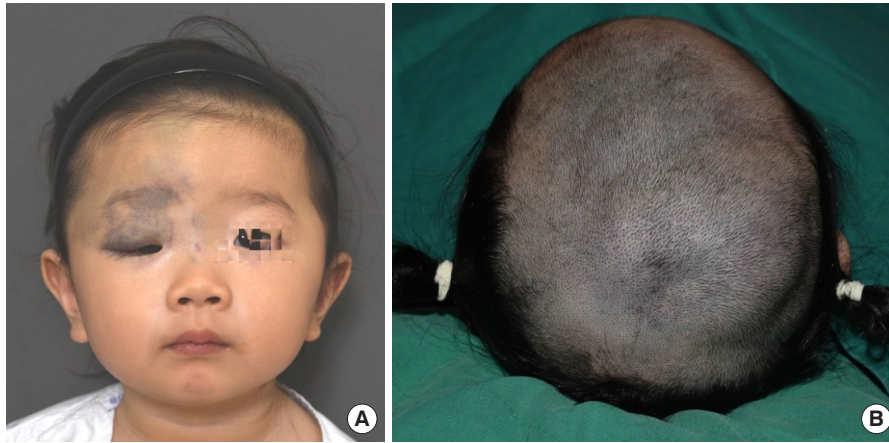
Fig. 1. A 2-year-old girl with sinus pericranii. (A) Venous malformations in the right periorbital region are seen on the frontal view. (B) Vascular masses on the scalp are also seen.