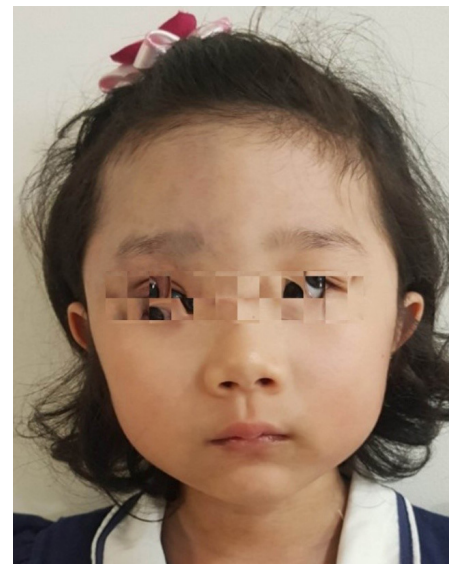
Fig. 5. Photograph of the patient 33 months after surgery. After surgical resection and sclerotherapies, venous malformations in the scalp and periorbital area have markedly improved.