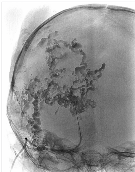
Fig. 4. Sclerotherapy for sinus pericranii. After ultrasonography-guided needling, sclerotherapy is being performed using a 30-mL mixture containing bleomycin, without acute complications.