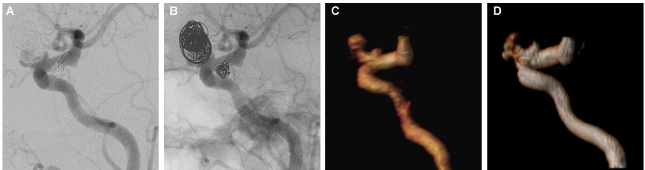
Figure 3 - An ophthalmic aneurysm with an aneurysmal remnant (class III), assuming a “helmet” type recanalization. A: DSA demonstrating aneurysmal remnant partially superimposed by the coil mesh. B: Angiography, without subtraction, showing the coil mass surrounding the aneurysm recanalization. C: CE-MRA with volume-rendered reconstruction showing the aneurysm remnant without interposition of the coil mesh. D: TOF-MRA with volume-rendered reconstruction showing the aneurysm remnant without interposition of the coil mesh but with slight loss of signal in comparison to CE-MRA.

due to overlapping of the coil mesh repositioned on the periphery of the aneurysm (helmet effect) (Figure 3).