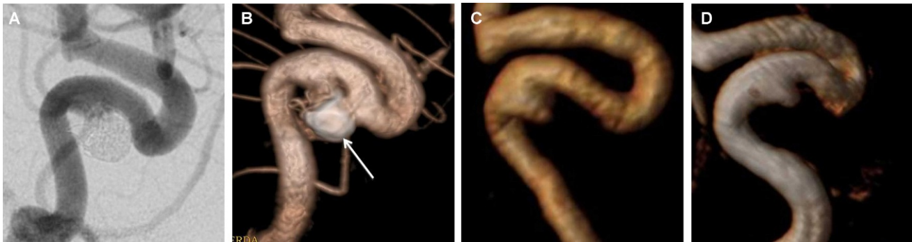
Figure 1 - Post-embolization follow-up of a cavernous carotid artery aneurysm, in working-view incidences, classified in consensus by both readers as class II in Raymond scale. A: DSA of the internal carotid artery showing the residual neck of the treated aneurysm (class II). B: DSA with 3D reconstruction delimiting the aneurysm residual neck (class II) and the coil mesh (arrow). C: CE-MRA with volume-rendered reconstruction showing class II recanalization. D: TOF-MRA with volume-rendered reconstruction showing class II recanalization.