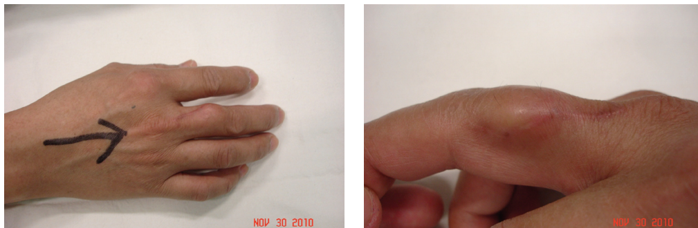
FIGURE 2: Gross picture four months after the injury. There is a mass at the radio-dorsal aspect of the proximal middle phalanx.