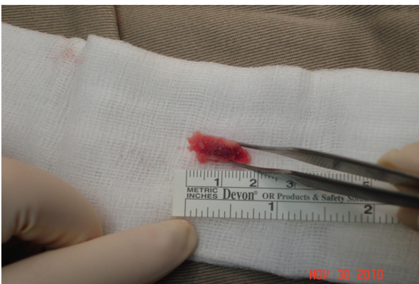
FIGURE 6: Partly calcified bony tissue up to 18 mm × 10 mm × 8 mm. The microscopic section shows a nubbin of bone surrounded by fibrovascular connective tissue. The marrow is predominantly fatty with prominent ectatic vessels and a patchy mild lymphocytic infiltrate. The decalcification block all embedded.

no literature that reprinted heterotopic ossification in the fingers after isolated traumatic injury. It is uncommon location occurred below the elbows and below the knees. Review of the literature from previous years to the present yielded only Spencer [1] reported a case of HO in finger following head injury. No other reported case was published in the literature.