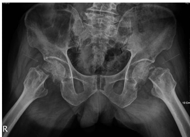
Figure 1 Pelvis radiography shows generalised osteopenia along with a bilateral femur neck fracture (arrow).

A 76-year-old man, without systemic disease but with progressive disability due to bilateral hip pain in 1 month, was brought to the emergency department. He denied any episode of trauma and was able to walk during his first visit to the emergency department. Pelvis radiography showed generalised osteopenia along with a bilateral femur neck fracture (figure 1). The patient was admitted to the hospital for bilateral total hip arthroplasty with Moore's prosthesis. Serum protein electrophoresis identified an M protein as a spike in the \alpha_2 , \beta or \gamma regions and a \kappa/\lambda ratio of 1096. The levels of haemoglobin and serum calcium were 11.5 and 8.5 mg/dl, respectively. Renal function was stable, with a creatinine level of 1.25 mg/dl. Bone marrow biopsy showed that 82.5% marrow cellularity consisted of plasma cells. A diagnosis of multiple myeloma was made. The patient is