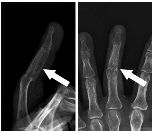
Figure 3 One-year follow-up: radiographic view of fused middle finger with no sign of recurrence.

GCT of bone is one of the most common benign or locally aggressive bone tumours, especially in the epiphysis region. 2 Peak incidence of GCT occurs in the third and fourth decades of life. 4 GCT in the hand has been noted as a rare location, with only 2% of reported cases. 2,3 Early radiographic signs can resemble enchondroma and are likely to be misdiagnosed by general practitioners or even by orthopaedists. However, the aggressive behaviour, for example, the progressiveness and painfulness, can help distinguish GCT from other benign tumours. Additionally, more rapid growth and a higher recurrence rate