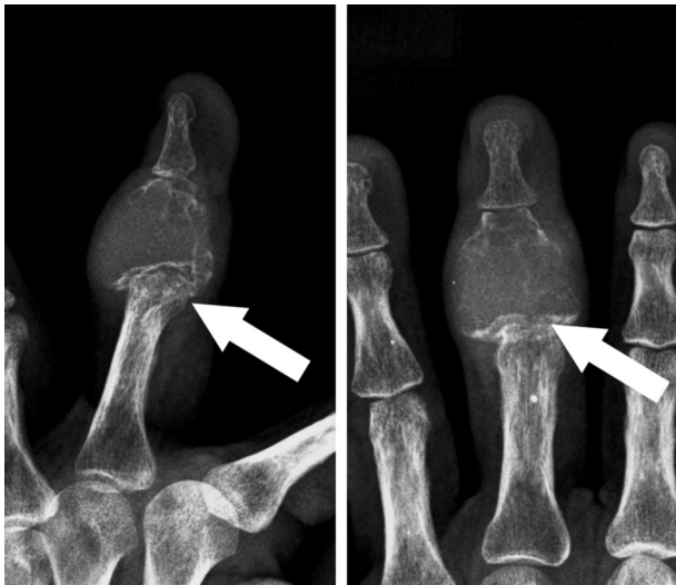
Figure 2 Six-months follow-up: an expansile geographic osteolytic lesion was identified by radiographic study.

of metastasis, no systemic treatments were scheduled for this patient.