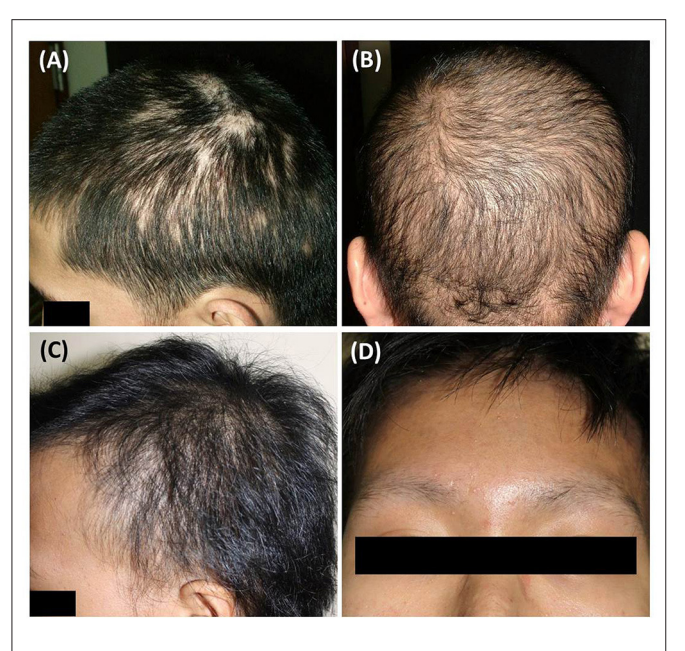
FIGURE 1 | Clinical manifestations of syphilitic alopecia: (A) moth-eaten alopecia; (B) diffuse alopecia; (C) mixed pattern; (D) alopecia of the eyebrows.

TABLE 2 | Trichoscopic findings of Thai patients with syphilitic alopecia.