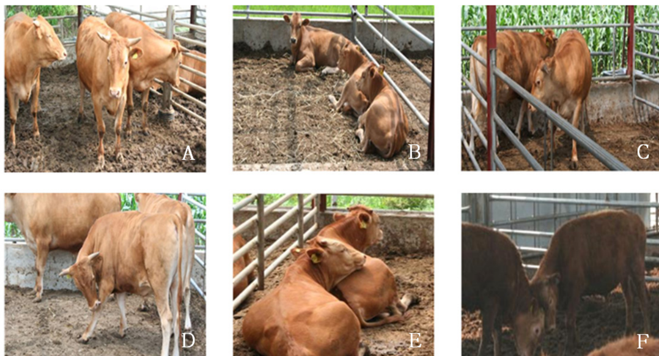
Figure 2. Classification of behavior characteristics. (A) Standing (ST), (B) Lying down (LD), (C) Walking (WA), (D) Self grooming (SG), (E) Leaning (LN), (F) Fighting (FT).