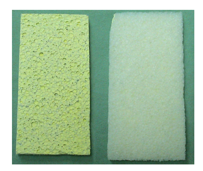
Figure 1 The yellow section represents the active part of TachoSil that has to be applied on to the liver surface.

TachoSil is a development of TachoComb® (Nycomed Linz, Austria) and TachoComb® H (Nycomed Linz, Austria). TachoComb is made with equine collagen, bovine thrombin, bovine aprotinin, and human fibrinogen. TachoComb H contains human thrombin in place of bovine thrombin. TachoSil contains only human fibrinogen with equine collagen as a carrier. It does not contain aprotinin or any other component of bovine origin. TachoSil works by mimicking the final steps of the natural blood-clotting process, creating a fibrin clot at the surgical site to achieve hemostasis in 3-5 minutes. TachoSil consists of a white collagen sponge coated on one side with fibrinogen and thrombin. Riboflavin gives a yellow appearance to the coated side (Figure 1). One of the most important achievements of TachoSil compared with its precursors is the possibility of storage at room temperature, avoiding the necessity of refrigeration or freezing. The product is ready to use, which represents an advantage when it has to be used quickly.