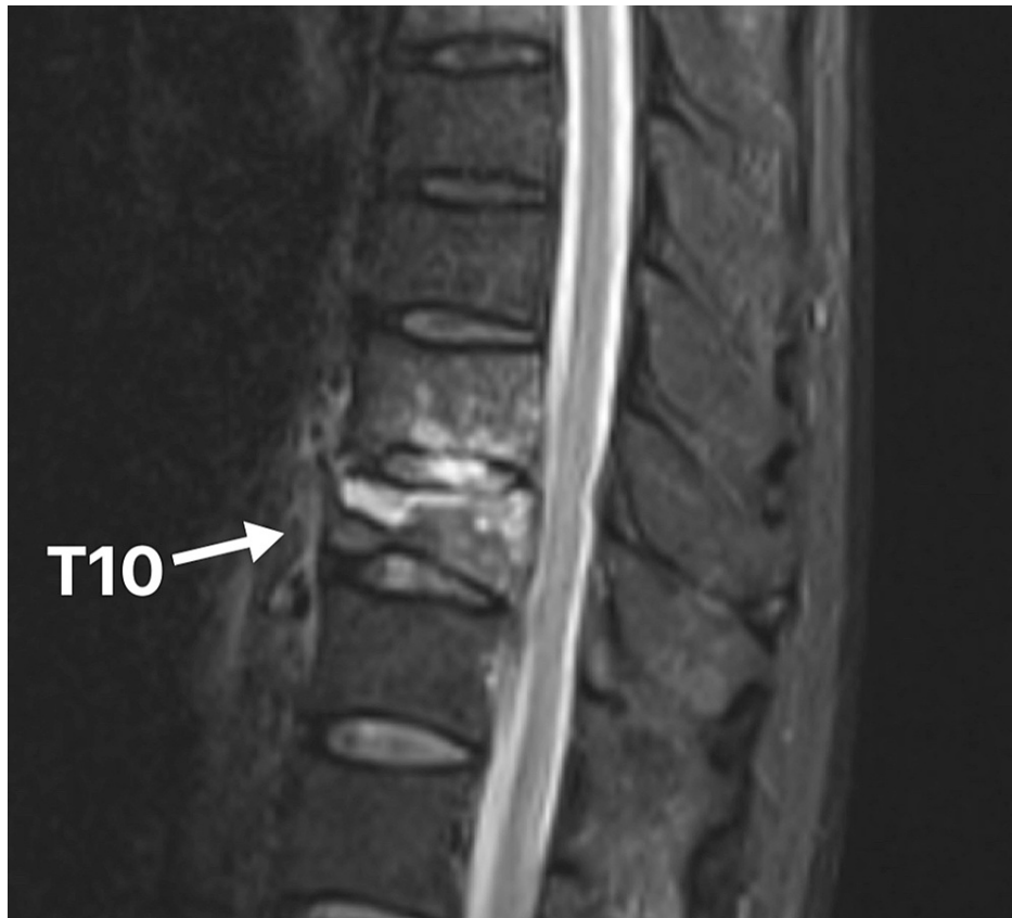
FIGURE 1: MRI spine sagittal view revealed hyperintense lesion over T9 and T10 vertebral bodies.