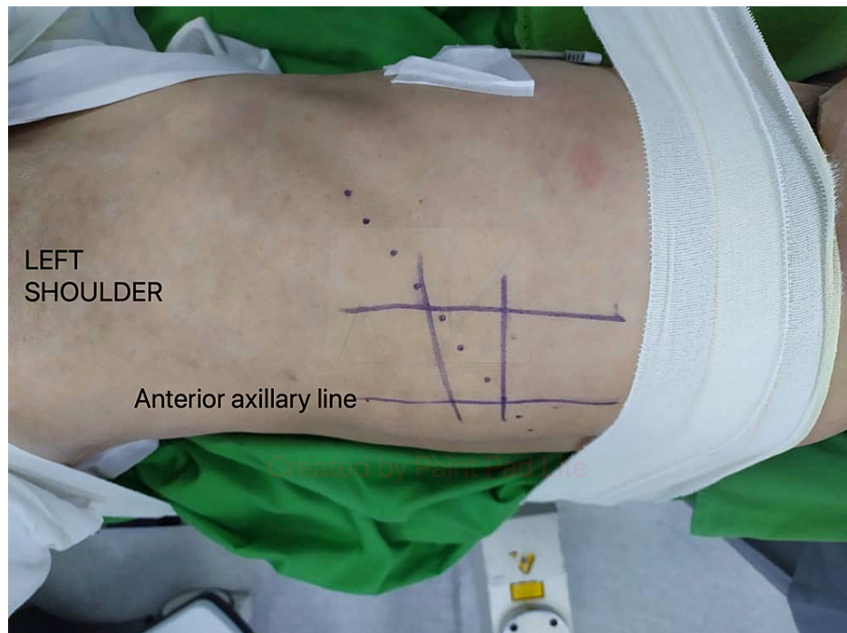
FIGURE 2: Surgical incision marking (dotted line) for transthoracic approach.