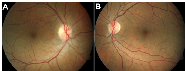
Figure 1 (A) Fundus photograph of the right eye shows swelling of the disc and disc rim hemorrhage (left). (B) Fundus photograph of the left eye shows a healthy appearing but crowded disc with a cup-to-disc ratio of 0.2 (right).

The injection of TA might have an effect on optic nerve circulation by the following possible mechanisms. First, the impaired optic nerve circulation is related to the inhibition of nitric oxide synthesis. Nitric oxide, known as a physiological vasodilator, is synthesized in vascular endothelial cells. Corticosteroids reduce its synthesis by altering the glucocorticoid receptor, which has been identified in endothelial cells. 8 Thus, impaired endothelium-dependent dilation may result in vasoconstriction of the arteries/arterioles that feed the optic nerve head, thus decreasing the optic nerve circulation. Second, an acute increase in vascular tone might be apparent. Corticosteroids raise the vascular tone by potentiating the effects of vasoconstrictor hormones and by acting directly on vascular smooth muscle cells. 9 Corticosteroids also enhance agonist-mediated pharmacomechanical coupling by increasing \text{Ca}^{2+} mobilization and \text{Ca}^{2+} sensitivity of myofilaments. 8 These vascular changes have been shown to develop within