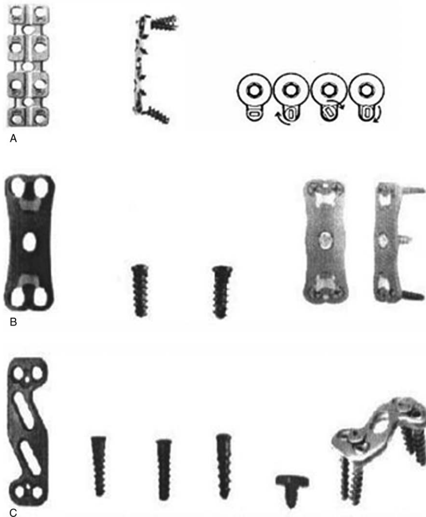
Figure 2. Three different titanium anterior cervical fixing system. (A) Codman plate, (B) Zephir plate, and (C) Orion plate.

the SP group, but no significant difference was found between the NR and NP groups (Table 2).