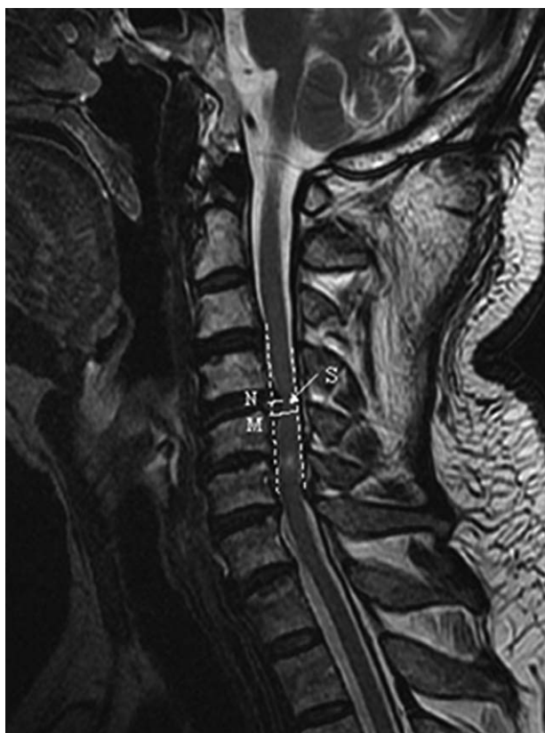
Figure 3. The definition and measurement of spinal cord compression. The compressing rate (CR) was defined as the thickness of the condensed spinal cord (N) divided by the anteroposterior diameter of the spinal cord (M) on the sagittal image on magnetic resonance imaging T2-weighted scanning preoperatively. CR = N/M \times 100\% . The CR and anteroposterior sagittal diameter of the spinal canal was measured at the most stenotic part of the spinal cord (S) on magnetic resonance imaging T2-weighted scanning.

reported that the PLL is fundamental in protecting the spinal cord and stabilizing the cervical spine. [2,19] However, Loughenbury et al [20] and Chen et al [21] demonstrated that the PLL also prevents protrusion of disc tissue into the spinal canal. PLL removal may lead to instability of the cervical spine and increase the risk of damage to the anatomical components of the cervical canal including the dura mater, spinal cord, nerve roots, and epidural vascular plexus. [12] Nevertheless, a clinical study conducted by Bai et al [17] has described the benefit of degenerative PLL removal in ACDF procedures for CSM. However, no definite indication was identified. Therefore, our study sought to identify the clinical indication for HPLL removal and to provide standardized removal in advance, based on HPLL mobility detected in ACDF for CSM patients.