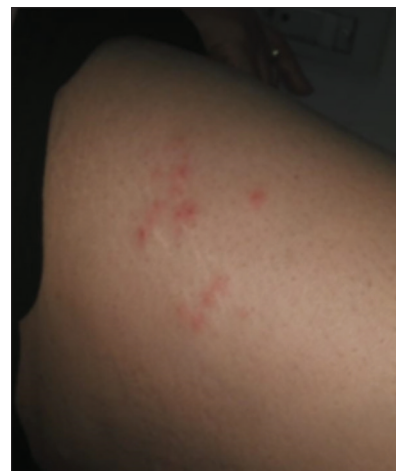
Figure 4: Anterolateral aspect of the right thigh of the 45-year-old female showing vesicular eruptions characteristic of herpes zoster