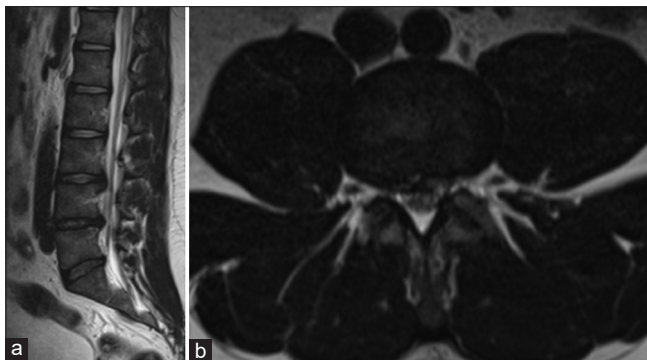
Figure 1: (a) Sagittal T2 weighted magnetic resonance imaging of the 30-year-old male showing mild disc bulge at L3-4 with mild compression of the nerve root on the right side (b) Axial T2 weighted magnetic resonance imaging of the 30-year-old male showing mild disc bulge at L3-4 with mild compression of the nerve root on the right side

In both cases, the initial diagnosis of discogenic pain was made based on clinical features corroborated by magnetic resonance (MR) image findings. The diagnosis was also confounded by the occurrence of rash following hot fomentation. If diagnosed, appropriate treatment can