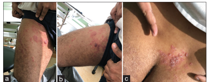
Figure 2: (a-c) Clinical picture of the 30-year-old male showing the classical vesicular eruptions on the anteromedial aspect of the thigh and right paraspinal region at posterior superior iliac spine