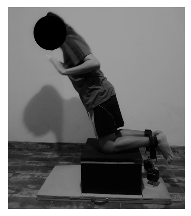
Figure 1: Assessment of eccentric knee flexor strength during the NHE execution.

Briefly, the participant was positioned to perform the NHE on a platform, and commercially available load cells (E-lastic; E-sporte Soluções Esportivas, Brasilia, Brazil) with simultaneous transference of data via Bluetooth were