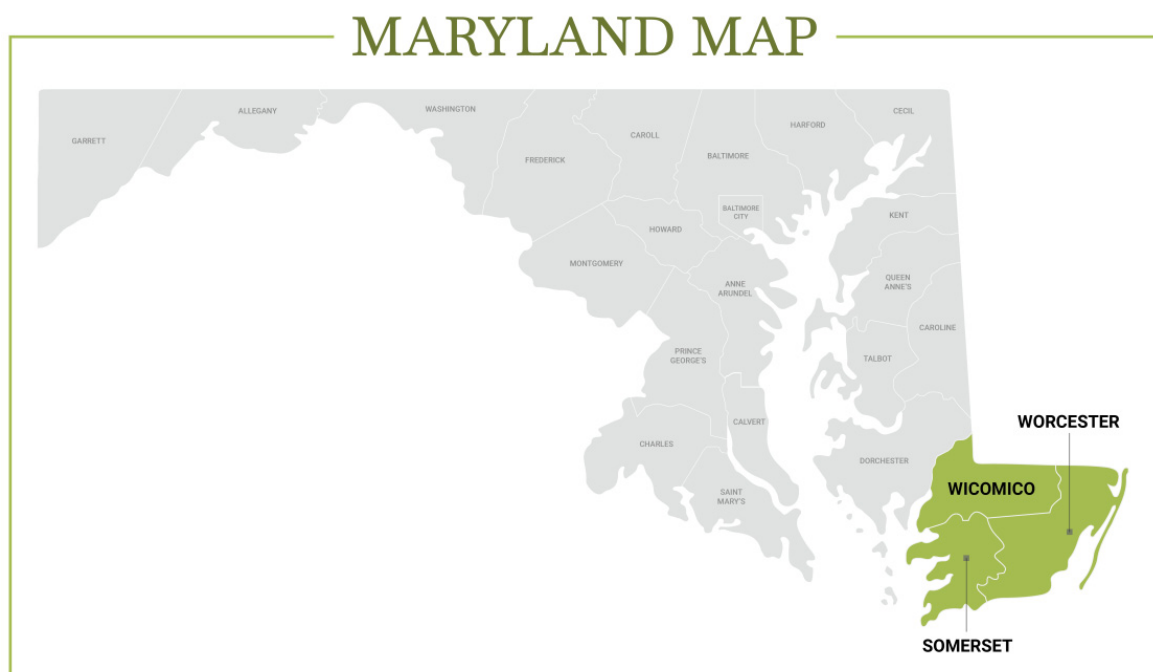
Figure 1. The lower Eastern shore of Maryland, U.S. Image created by MRamadhon and reproduced with permission.

The lower Eastern shore of Maryland lies on the east side of the Chesapeake Bay and consists of Wicomico, Worcester and Somerset counties (Figure 1). The main economic activities for this rural region include agriculture and large-scale chicken breeding. In 2014, Maryland ranked ninth among all states in the nation in broiler chicken production, with Wicomico, Worcester and Somerset counties being the top three producers of poultry and eggs within the state [14–17]. Approximately 600 million chickens are produced yearly between the lower Eastern shore of Maryland and the nearby county of Sussex, Delaware [18]. Per the EPA, these birds produce approximately 5.7 billion pounds of manure annually, contributing around 5 million pounds of nitrogen to local waterways per year. Combined with other agricultural sources on the lower Eastern shore, these farms, also known as animal feeding operations (AFOs), add a total of 119 million pounds of nitrogen pollution to the Chesapeake Bay on an annual basis. Given this documented contamination of local waterways by agricultural non-point source pollution, the economic activities prevalent on the lower Eastern shore of Maryland raise concern over the risk for ground water contamination in this region.