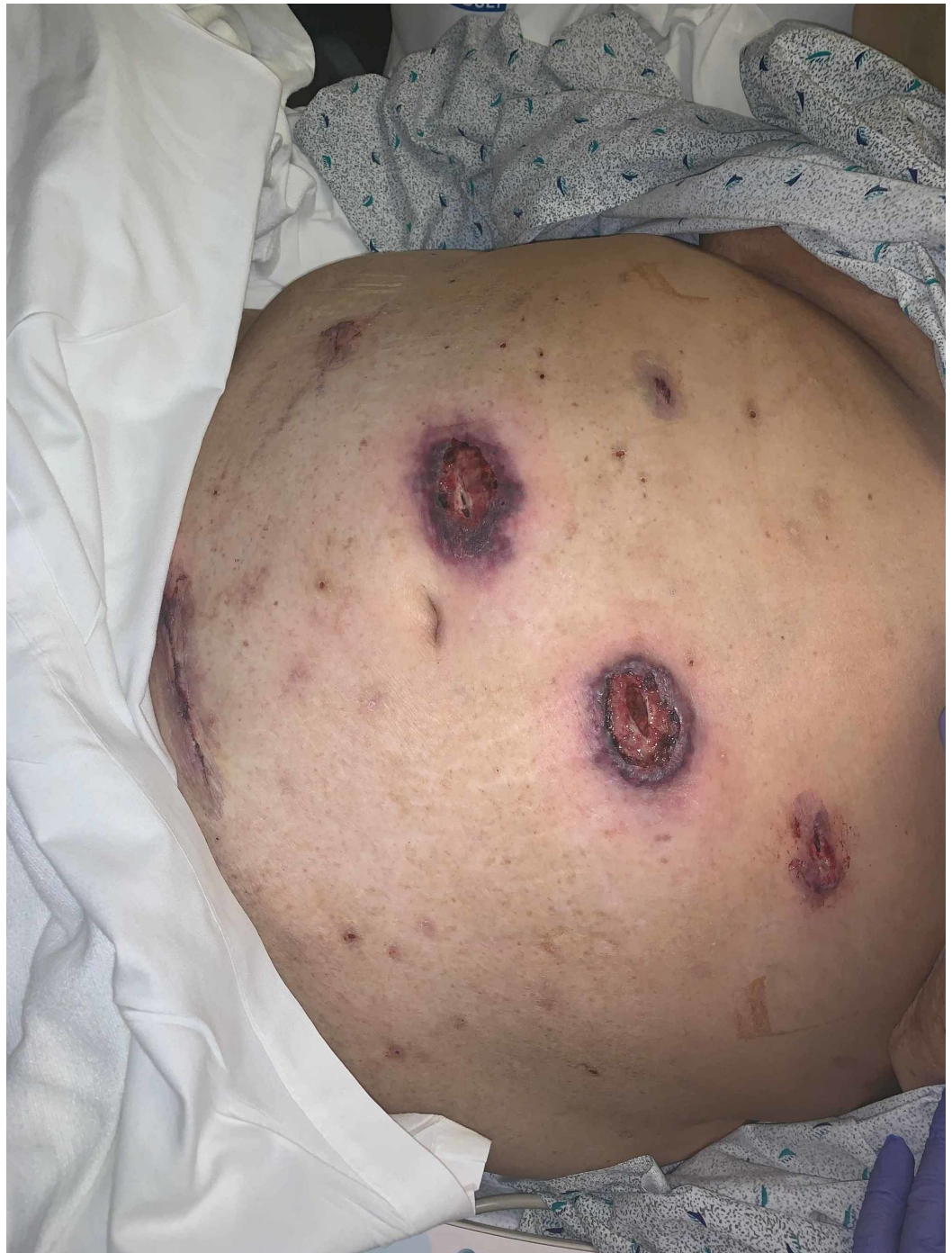
FIGURE 5: Violaceous and necrotic lesions spreading to distant sites

She was treated with vacuum-assisted closure (VAC) therapy, prednisone, and infliximab. Metronidazole and clobetasol topicals were applied around the borders bi-daily. Despite treatment, her wounds continued to expand as such: 19x3x3 cm Pfannenstiel wound on midline lower abdomen, 10x3x0.5 cm wound on right lower quadrant, 32x15x5 cm wound on midline abdomen extending vertically, and 7x7x4 cm sacral wound (Figure 6).