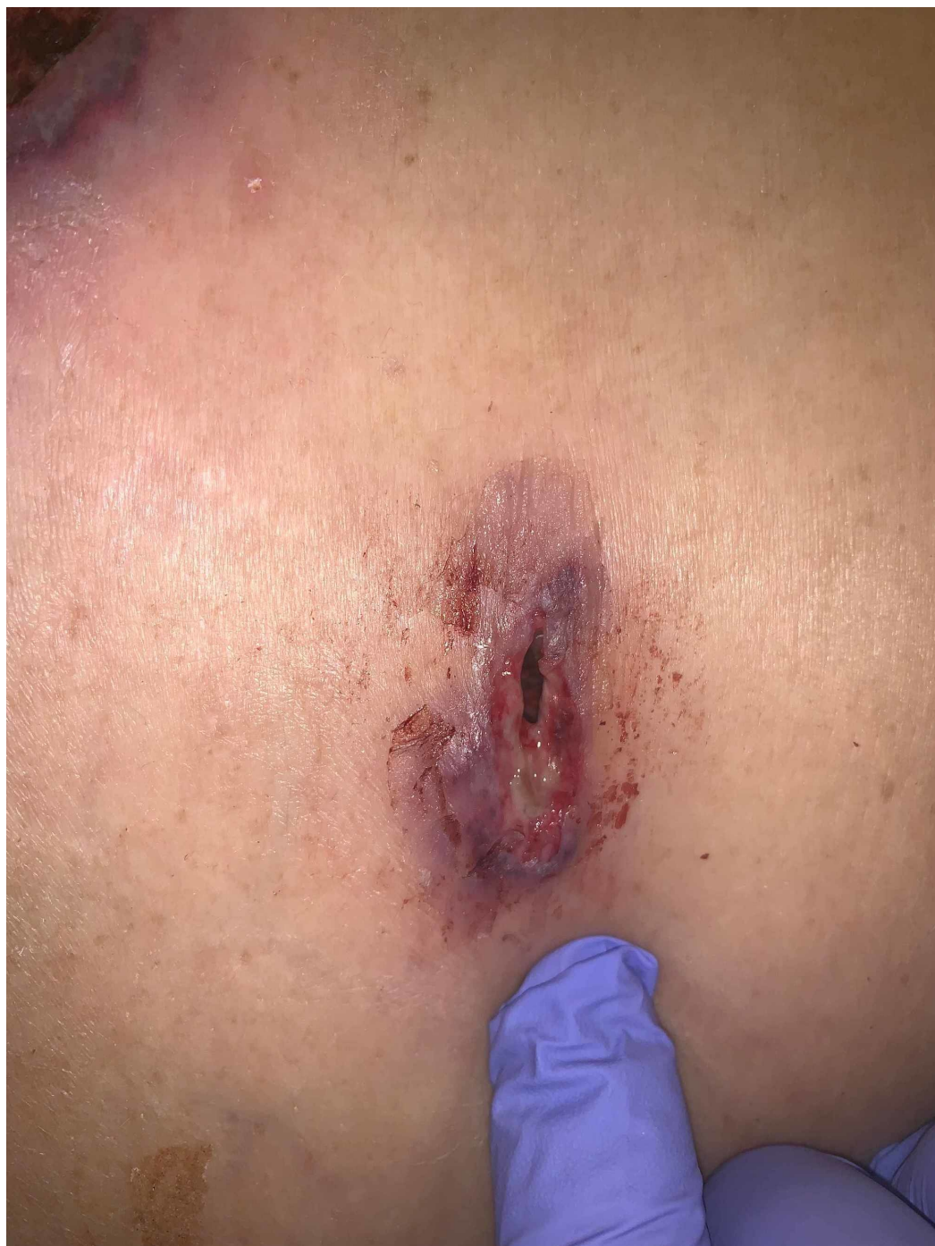
FIGURE 3: Post-operative day 10 violaceous and ulcerative borders of midline port site

Prior to initiating steroid treatment, a barium enema revealed an anastomotic leak and she underwent open laparotomy for abdominal washout with ileo-ascending colon resection, ileo-ascending anastomosis, repair of the defect anastomosis with diverting loop ileostomy. Her postoperative course was further complicated by wound dehiscence and worsening areas of large violaceous ulcerations (Figure 4 and Figure 5).