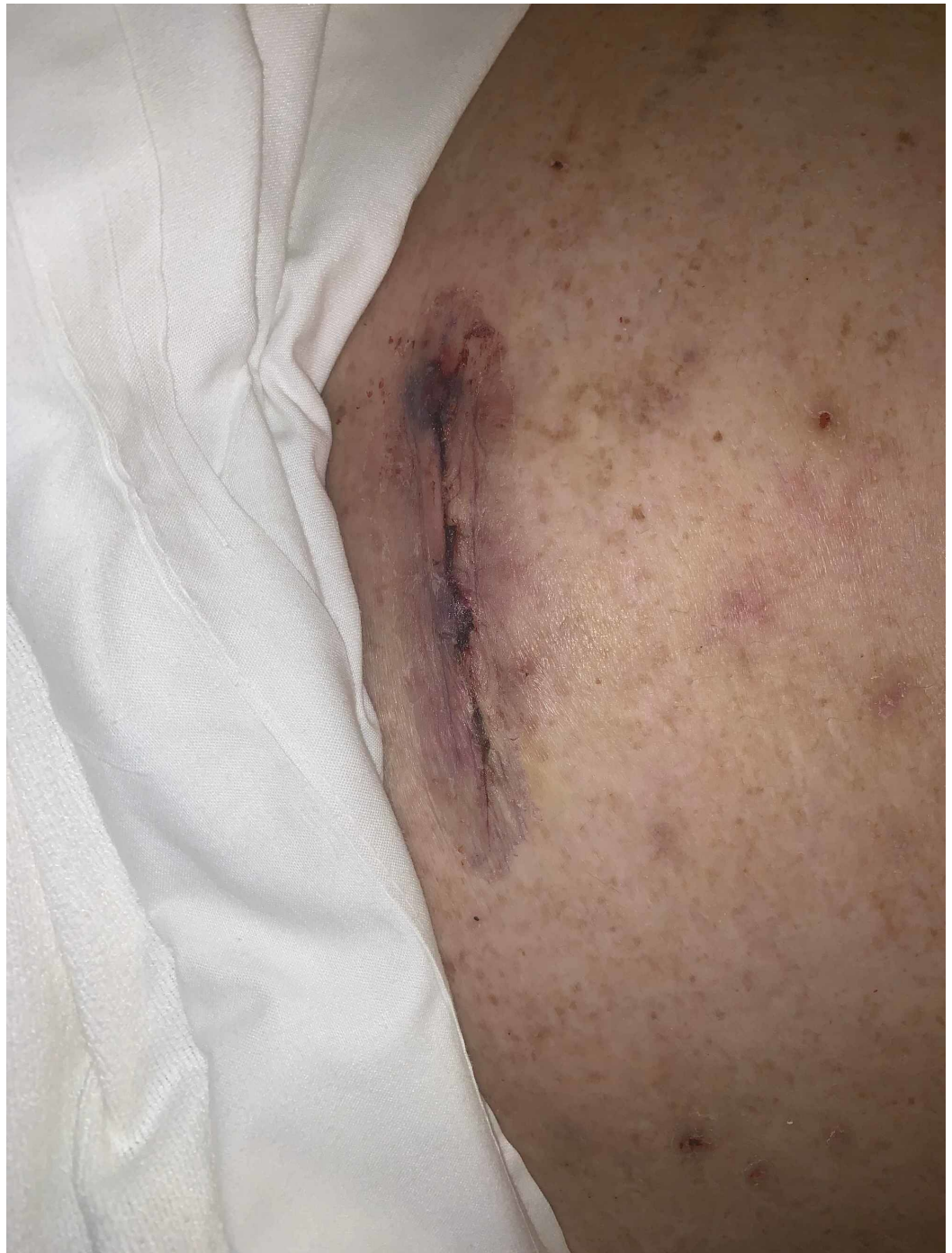
FIGURE 1: Post-operative day nine, necrotic skin and subcutaneous tissue

On post-operative day nine, she developed necrotic skin and subcutaneous tissue at the port sites. The periumbilical port site was described as a rolled inflammatory gun metal grey to violaceous bordered lesion.