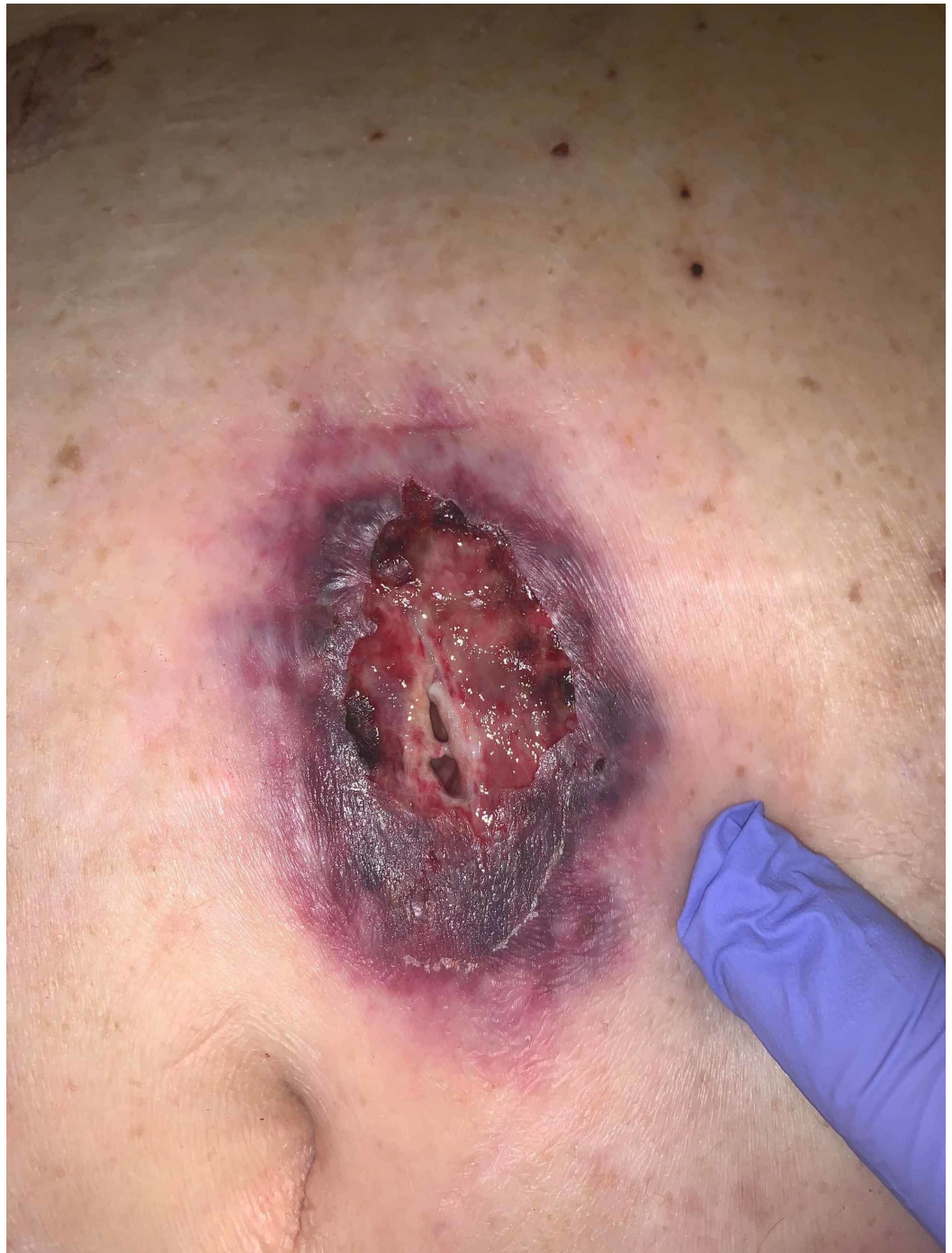
FIGURE 4: Post-operative day 11 ulcerative erosions of midline port site

Wound dehiscence at initial pyoderma gangrenosum sites status post laparotomy for anastomotic leak repair.