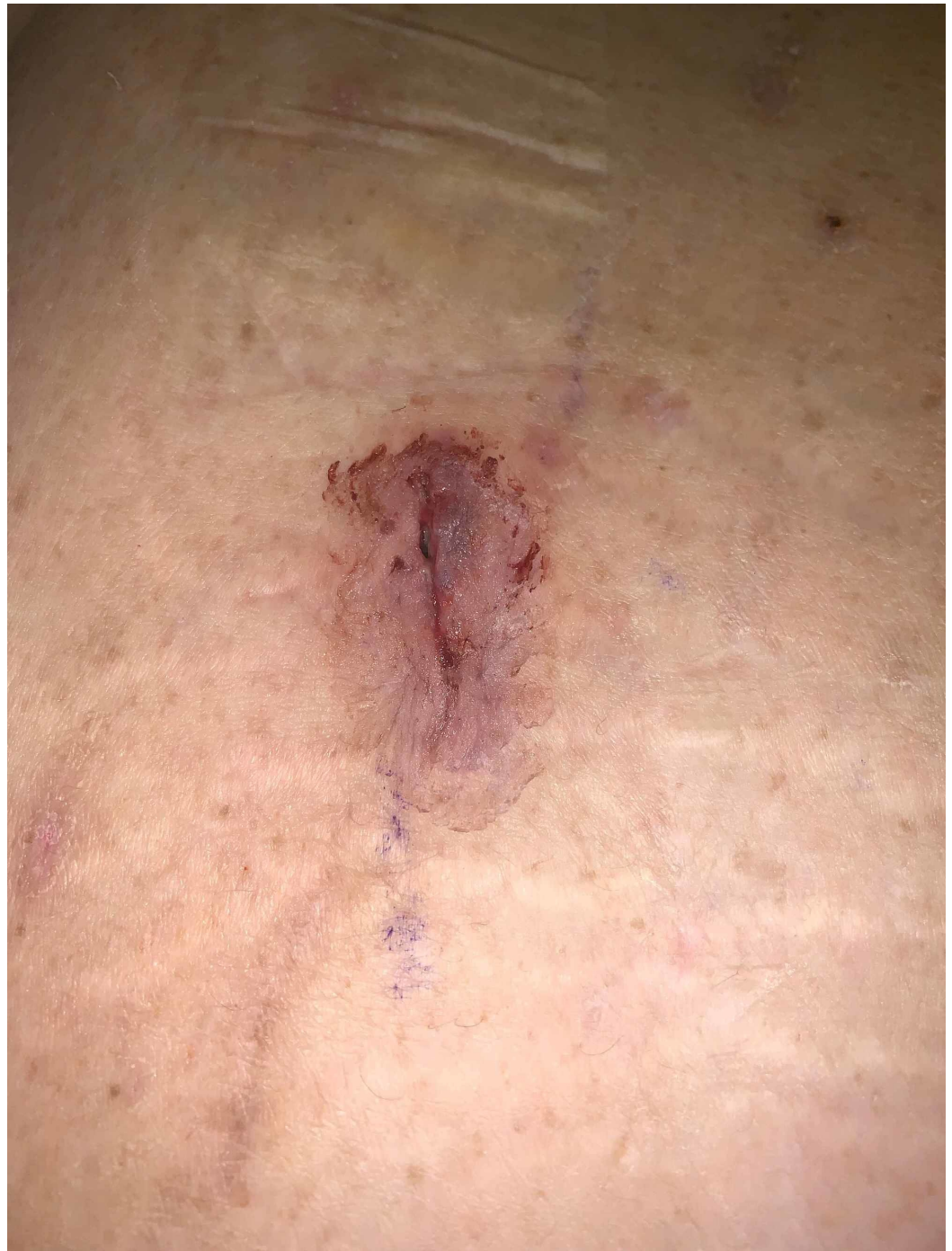
FIGURE 2: Post-operative day nine, erythematous borders of midline port site

Simultaneous development of pyoderma gangrenosum lesions at midline port site.