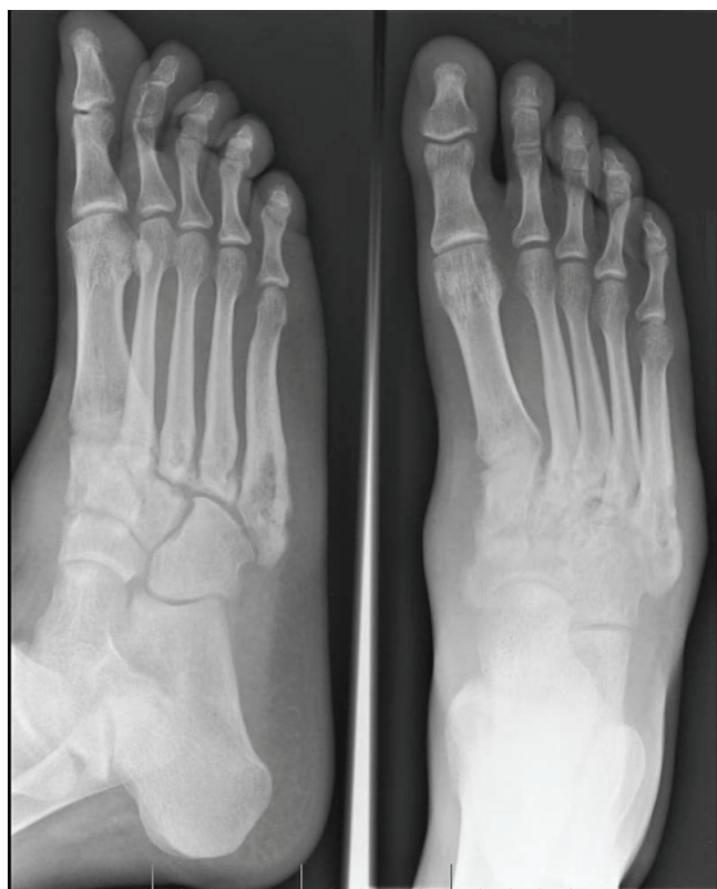
Figure 1. Right foot x-ray on day of admission - 2 views. Abnormal lucent lesions are seen at the base of the 3 rd , 4 th and 5 th metatarsals.

base of the 3 rd , 4 th and 5 th metatarsals but no recent fracture (Figure 1).