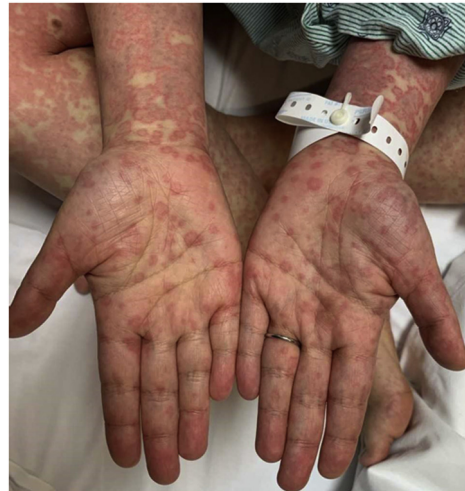
Fig 3. DRESS syndrome. Erythematous, edematous annular papules coalescing into plaques on bilateral palms. DRESS , Drug reaction with eosinophilia and systemic symptoms.

She showed clinical improvement with normalization of laboratory values over the following weeks until 11 weeks, when she presented for another flare. After taper completion, blisters developed on her hands and feet, requiring resumption of oral prednisone at 30 mg/d. Dosage decreased to 20 mg/d upon clinical improvement. She continued