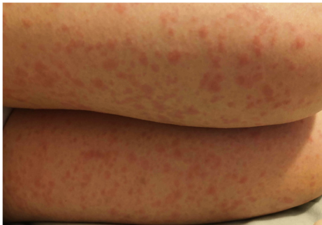
Fig 2. DRESS syndrome. Erythematous, edematous annular papules on bilateral thighs. DRESS , Drug reaction with eosinophilia and systemic symptoms.

In the interval, she again presented for rash persistence to the emergency department, where oral prednisone was increased to 60 mg/d. Physical examination found superficial desquamation of the face with significant improvement of edema. Diffuse morbilliform eruption to the trunk and new erythematous papules to forearms and thighs were noted. Steroid tapering over 4 to 6 weeks was initiated in addition to emollients and topical steroids.