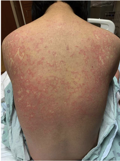
Fig 1. DRESS syndrome. Erythematous, edematous annular papules coalescing into plaques on the back. DRESS , Drug reaction with eosinophilia and systemic symptoms.