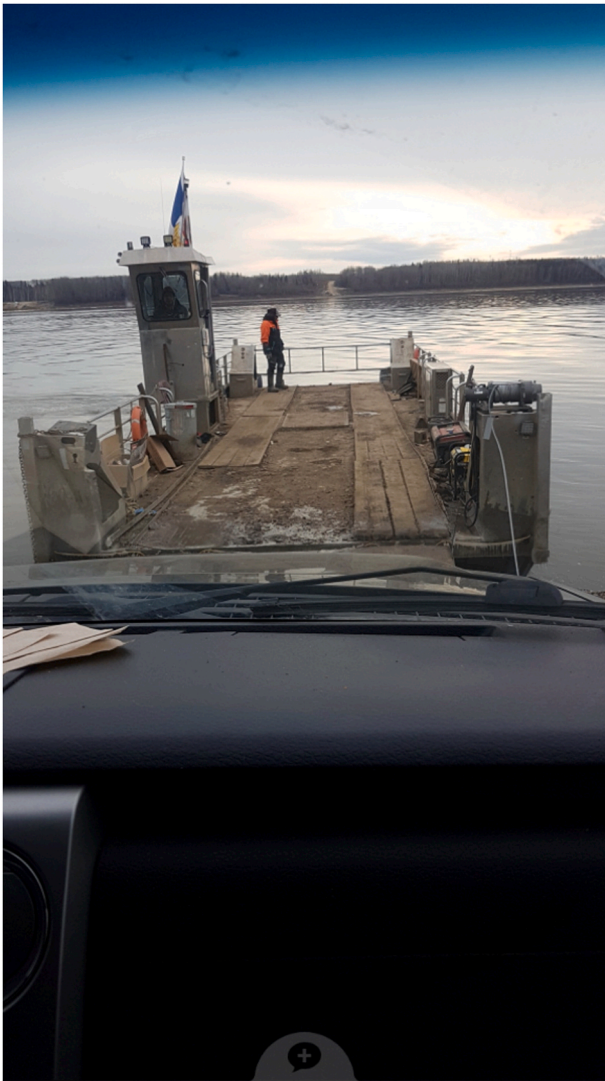
Fig. 2. A barge.

observations were a timely reminder that, for rural residents with limited mobility and/or food security, the hoarding instincts of their fellow townspeople might have perilous implications.