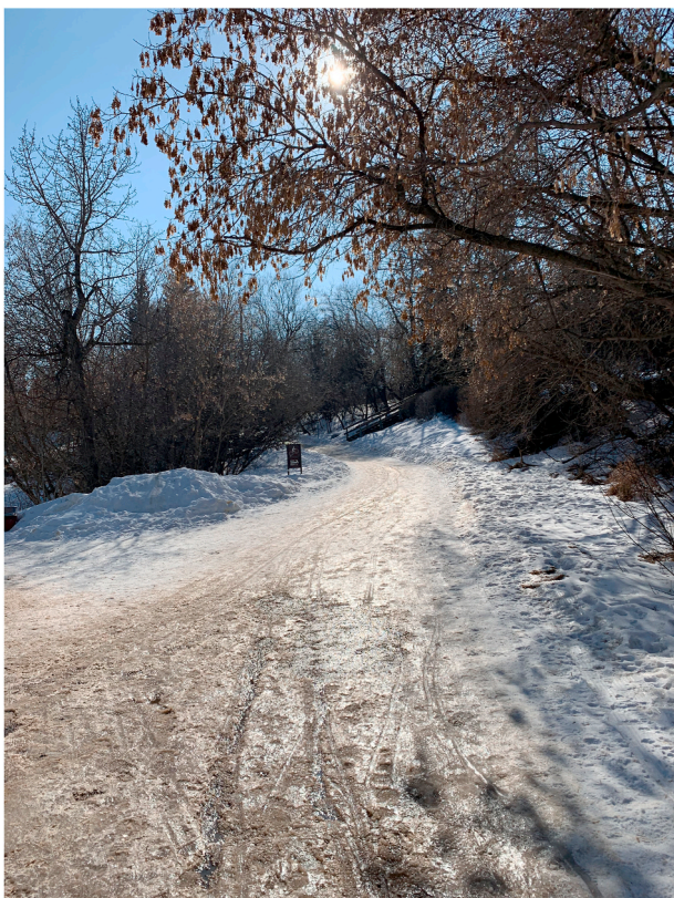
Fig. 10. The river valley.

As of this writing, in early May 2020, Alberta’s rural hospitals appear to have been spared the worst-case scenario—a surge of critical COVID-19 cases beyond capacity. The medical students are slowly being reintegrated into the clinical environment. In the coming months and years, the global, psychosocial aftermath of the outbreak on frontline health care workers will no doubt be compared and contrasted with the recent outbreaks of SARS, H1N1, and Ebola, with many calls for policy reform. We could well expect to see a spike in post-traumatic stress amongst nurses and physicians in the hardest-hit regions (Bai et al., 2004; Brooks et al., 2020; Marjanovic et al., 2007; Maunder et al., 2003; Pan et al., 2005; Reynolds et al., 2008; Wu et al., 2009). This is not to suggest that rural communities and hospitals in Alberta are insulated from the effects of the pandemic. Physician and nurse attrition—already a major concern in the wake of recent cutbacks—may accelerate with the inevitable crash of the provincial economy (Bellefontaine, 2020). As public funds