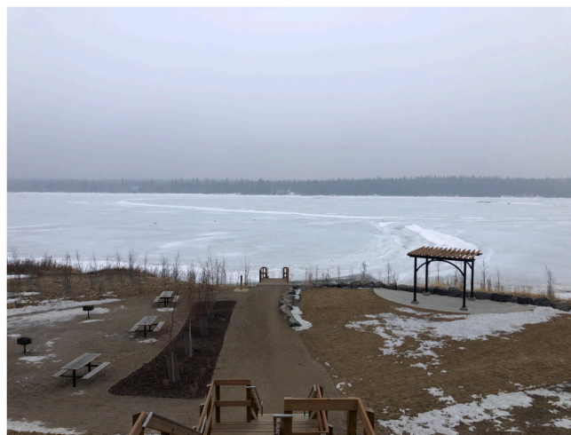
Fig. 11. The glenmore reservoir.

become increasingly scarce, our province may be at risk for a wave of rural hospital closures (Kacik, 2020). And as our data illustrate, rural and remote areas are already among the hardest hit by pandemic-related disruptions to supply lines, which may prove fatal for the most vulnerable community members.