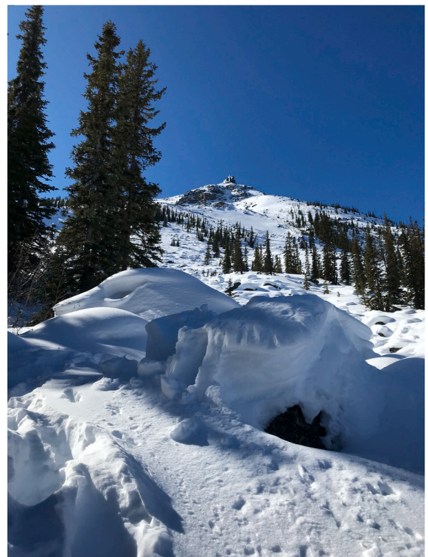
Fig. 4. Social distancing.

Other longstanding rural habits proved hard to break in the age of COVID-19. Social distancing runs contrary to small-town community ethos, where everyone knows everyone else. After a brief stop in the city, Sophia returned to her hometown (population 10,000) only to find herself struggling to adjust. "In the city, I was aware of how people will circle around each other to maintain that distance, but that almost didn't apply to people living rurally. The warnings are there for a reason; I just didn't realize how difficult it would be to follow them." At last, she resorted to hiking in the mountains (Fig. 4) as a way of keeping her distance and her mental equilibrium.