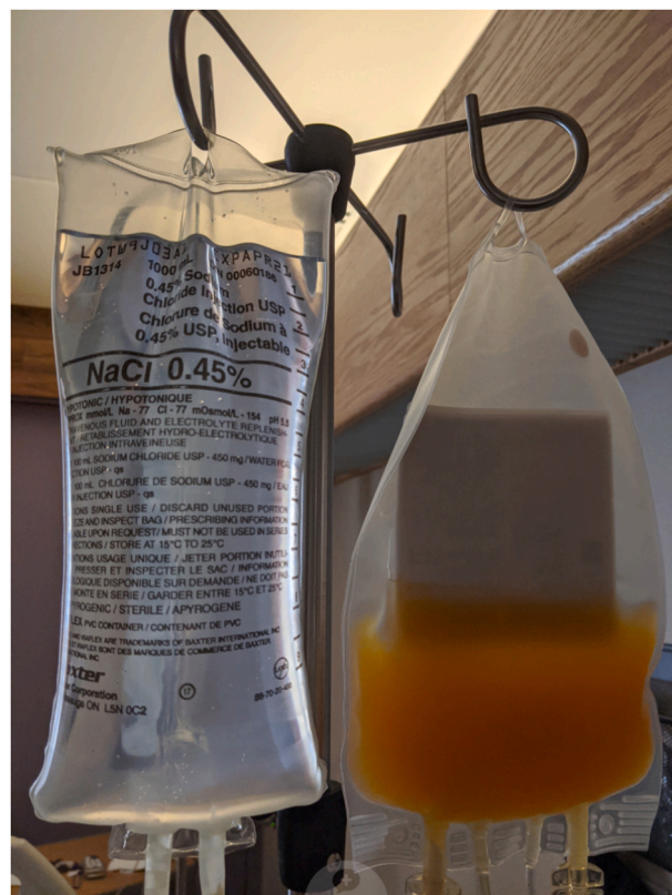
Fig. 1. Platelets.

Beyond the clinical setting, distance, remoteness and infrastructure were already prominent social determinants of health, well before pandemics entered the current public discourse. Bradley, a medical student placed in northern Alberta, 450 km from the nearest city, photographed an ancient barge crossing a river ( Fig. 2 ), 3 h' drive further east—the only access to a First Nations (Indigenous) reserve where his preceptor conducted an outreach clinic. "For a community of nearly 4000 people, this barge, that fits at most two regular-size vehicles, is the main use of transport," he remarked. "This leads to frequent, very long line-ups in and out of the community, and keeps goods very expensive, perpetuating a cycle of poverty." Shortages and inflated prices—now daily stressors for most Canadians—are nothing new to such communities, all but cut off from the supply chains we have taken for granted until recently. Even less remote communities were hit hard by the recent spate of panic buying. Linda (nursing) photographed empty shelves at the local Sobey's—the only grocer for 90 km—commenting, "It's not like in the city, when I go grocery shopping. Oh, Costco ran out of this—I'll check the Safeway by my house ... It's just not there, so you're out of it for however many days, until it gets re-stocked. " Linda's