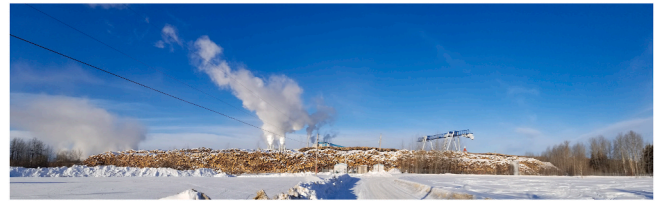
Fig. 3. Emissions.

Even before COVID-19, the perceived volume of patients presenting in the local emergency room, with non-urgent respiratory complaints, concerned at least one participant. "I found that the emergency department was being taken advantage of as a walk-in clinic, and had many people coming in with cough and cold-like symptoms, or for