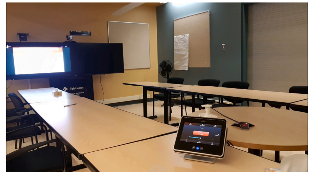
Fig. 8. Telehealth.