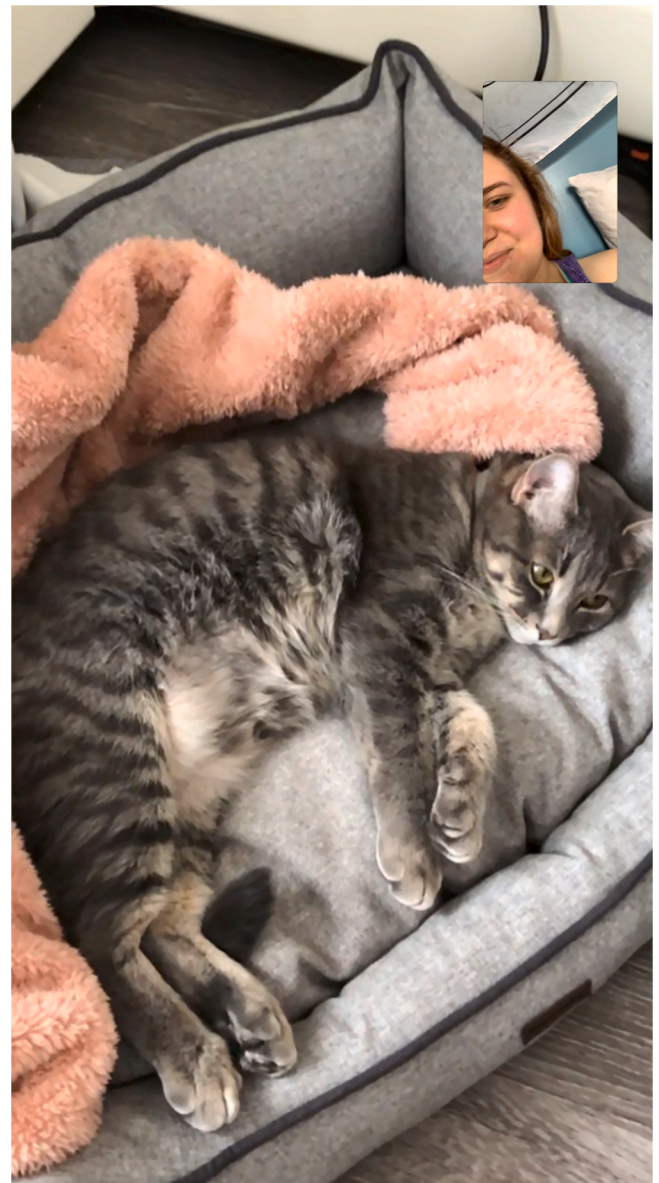
Fig. 9. FaceTime.

Isolation and confinement are common stressors during prairie winters. During their placements, the students often capitalized on nearby, natural settings to make the most of the season and cope with separation from friends and family—a strategy which carried over into