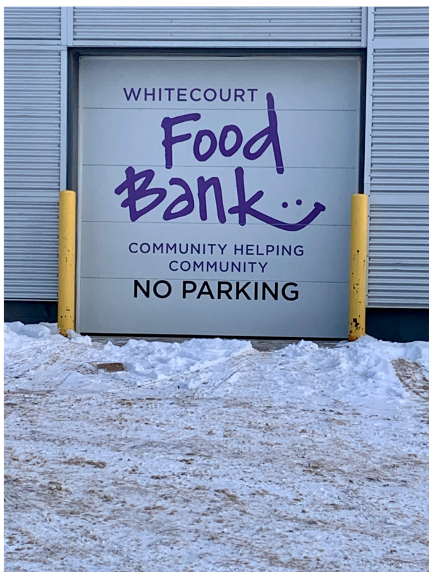
Fig. 5. Loading dock.

For the students, rural preceptorships were as much about constructing identities as acquiring clinical skills. Not only did participants become personally invested in the health care teams with whom they